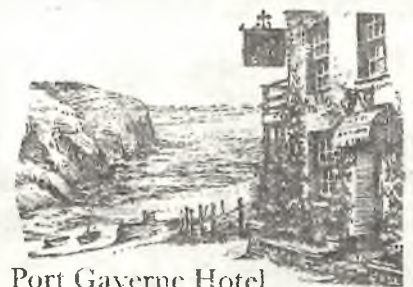
Port Gaverne Hotel

As only three entries have been received in our competition to find a short name for the newsletter, the £5 prize is being held until more ideas come in.