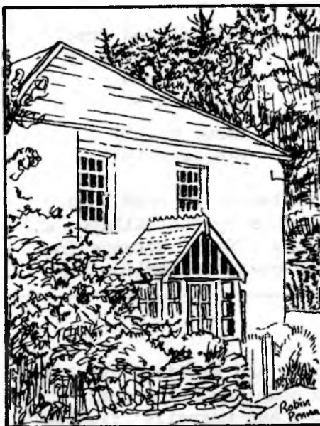
Where's it to?

(Port Isaac - 498 - 24 hours Answerphone)