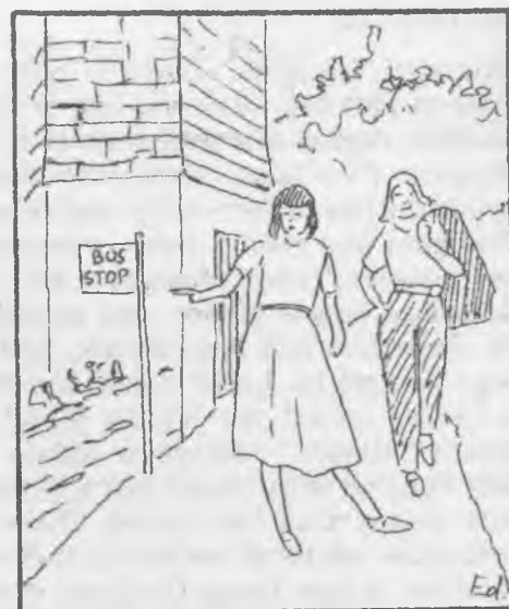
Look! Now they've taken the steps away in Margaret's Lane - there's buses!