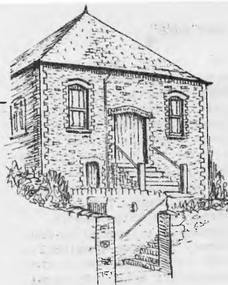
COZ THE CLOWN

PAT AND TONY SWEET FRETHERWAY HOTEL FORE ST BOD, 880214 WISH THE VILLAGE HALL GOOD LUCK WITH THEIR FUND-RAISING EVENTS.