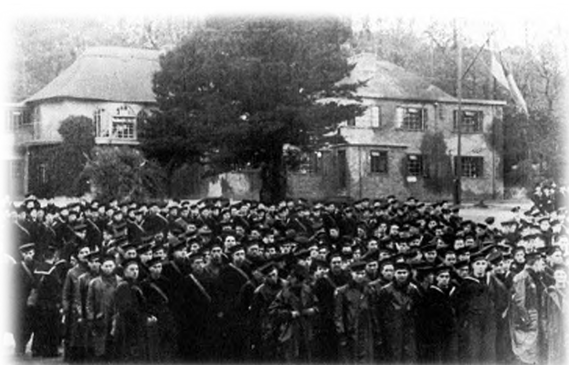
Sailors waiting outside Sparrows Nest for details of their allocated vessel