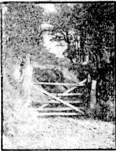
Where's it to?