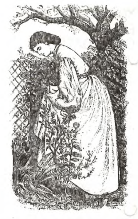
Our Editor tending the roses in the garden of her cottage in Port Isaac.

Every street has a different Code, and long streets are divided into more parts each with its own code.