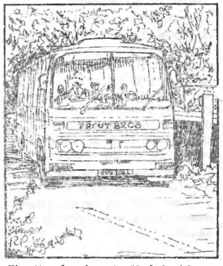
The Monday bus to Wadebridge coming through the water-splash at St. Kew.

Monday 10th. February, 7.30pm. Church Rooms, Port Isaac.