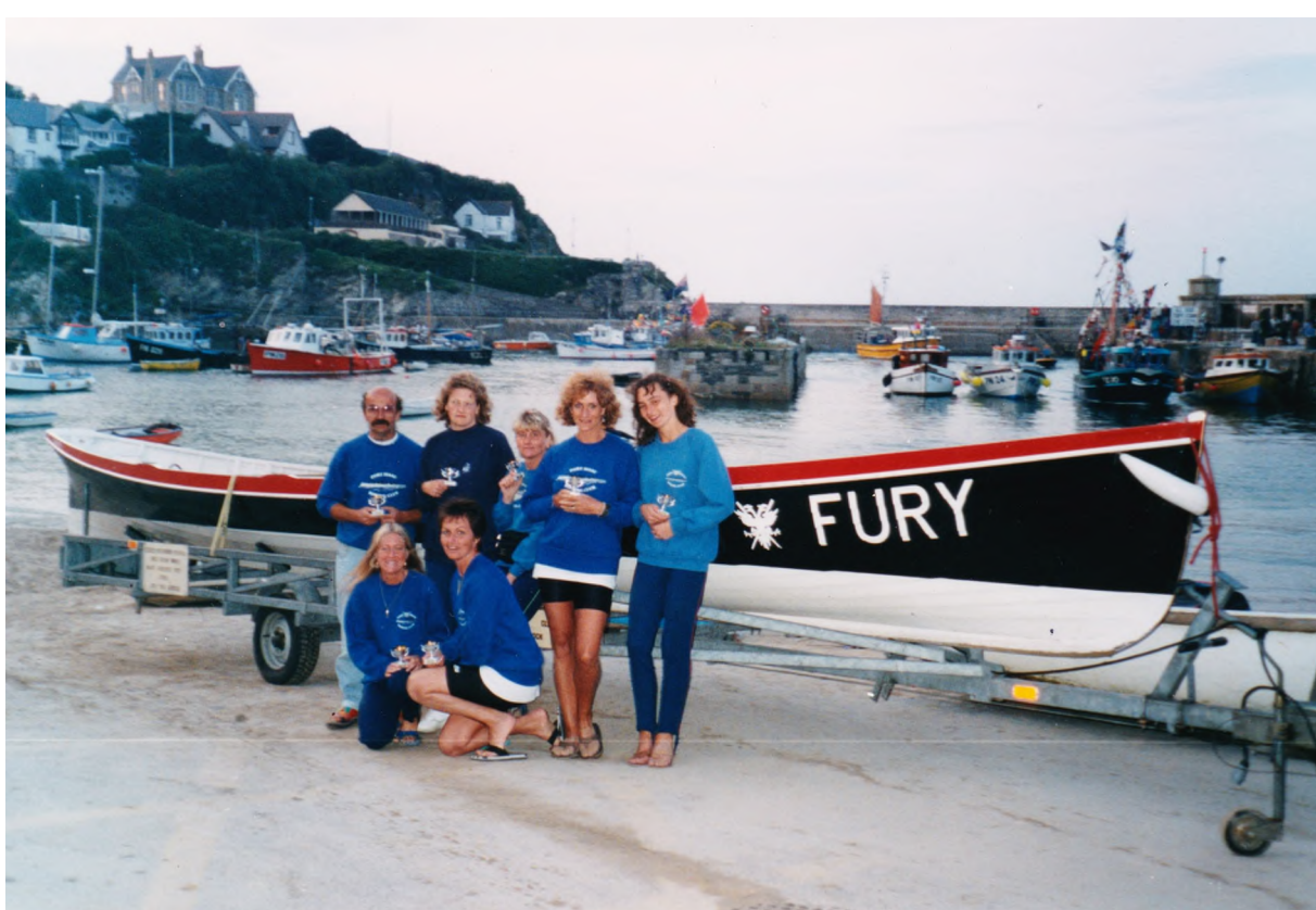
The Ladies Crew and the Gig they rowed in the Championship final

Horrendous weather conditions when Port Isaac hosted a number of gig racing crews in July.