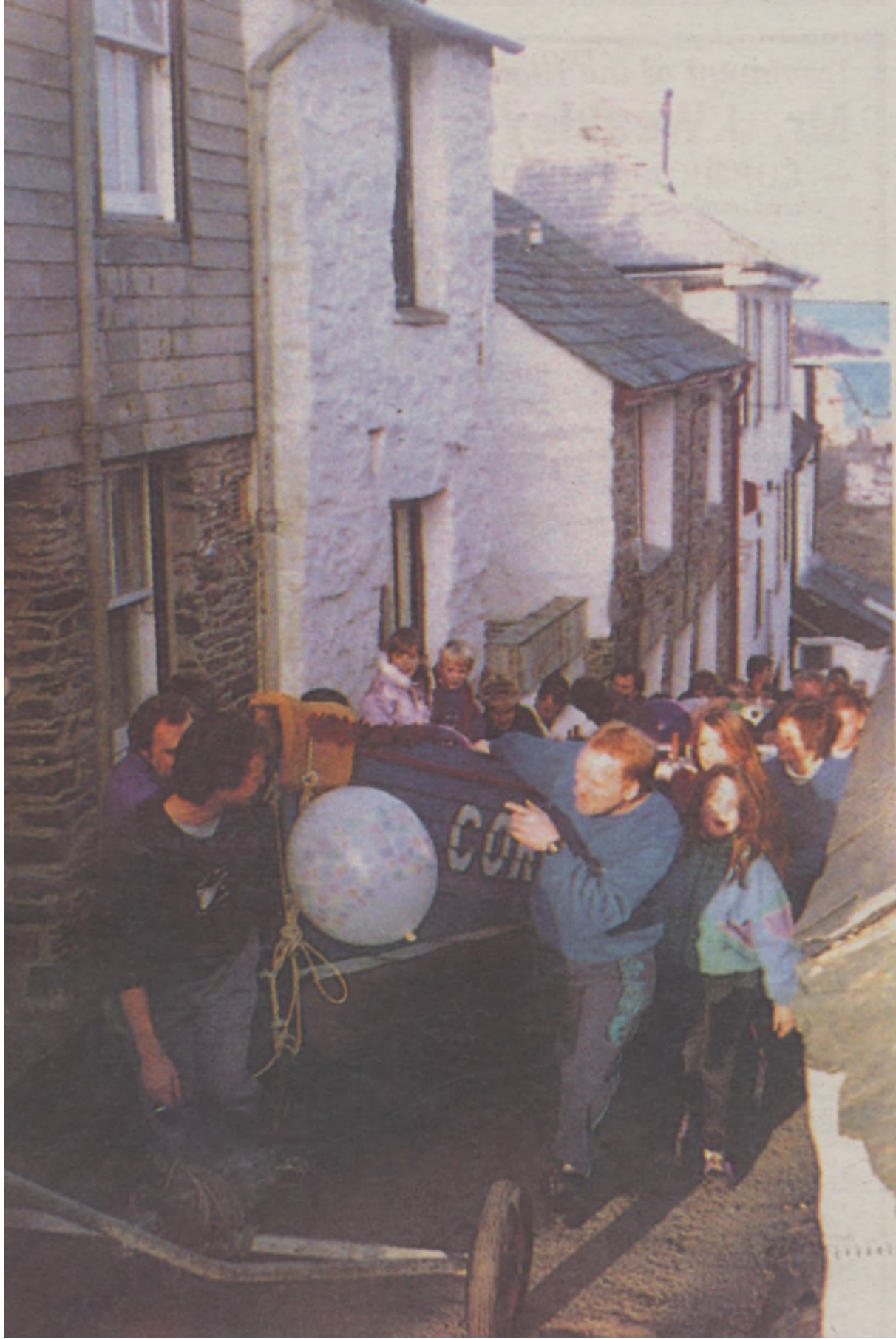
Corsair reaches one of the narrower parts of Church Hill, leaving little room for the 'pushers'

it was pretty hard going this year; last year ropes had been attached to the gig and were many people pulling as well as pushing. This year there were no ropes - unanimously agreed as a mistake that will be rectified in 1994.