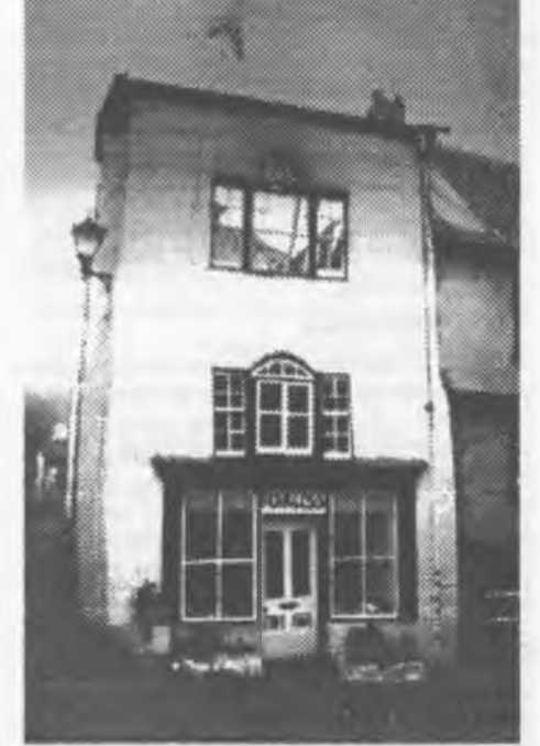
The forlorn ruin of Victoria House after the fire – but see article below.