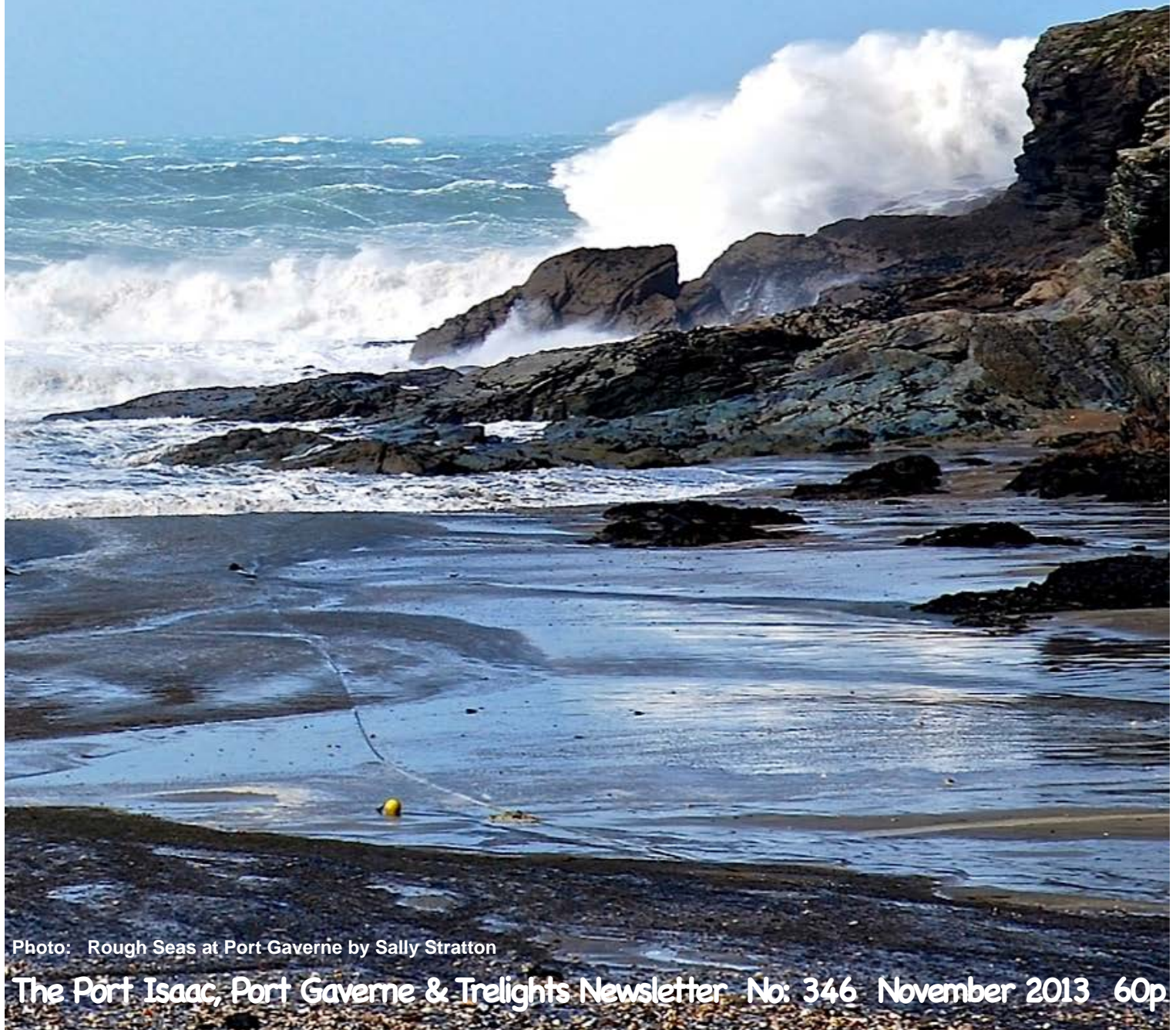
Photo: Rough Seas at Port Gaverne

The Port Isaac, Port Gaverne & Trelights Newsletter No: 346 November 2013 60p