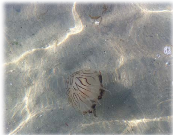
Tony's photograph of a jellyfish in local waters

When we hear such serious concerns about the future of the marine environment, it is projects such as this that can give us hope that something can be done.