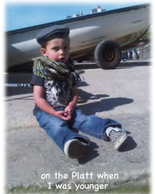
on the Platt when I was younger