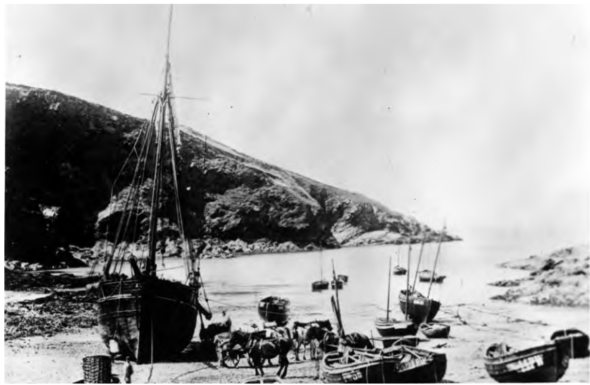
Discharging Herrings at Port Isaac. (See Profile of Jack Tar in the Cliff).