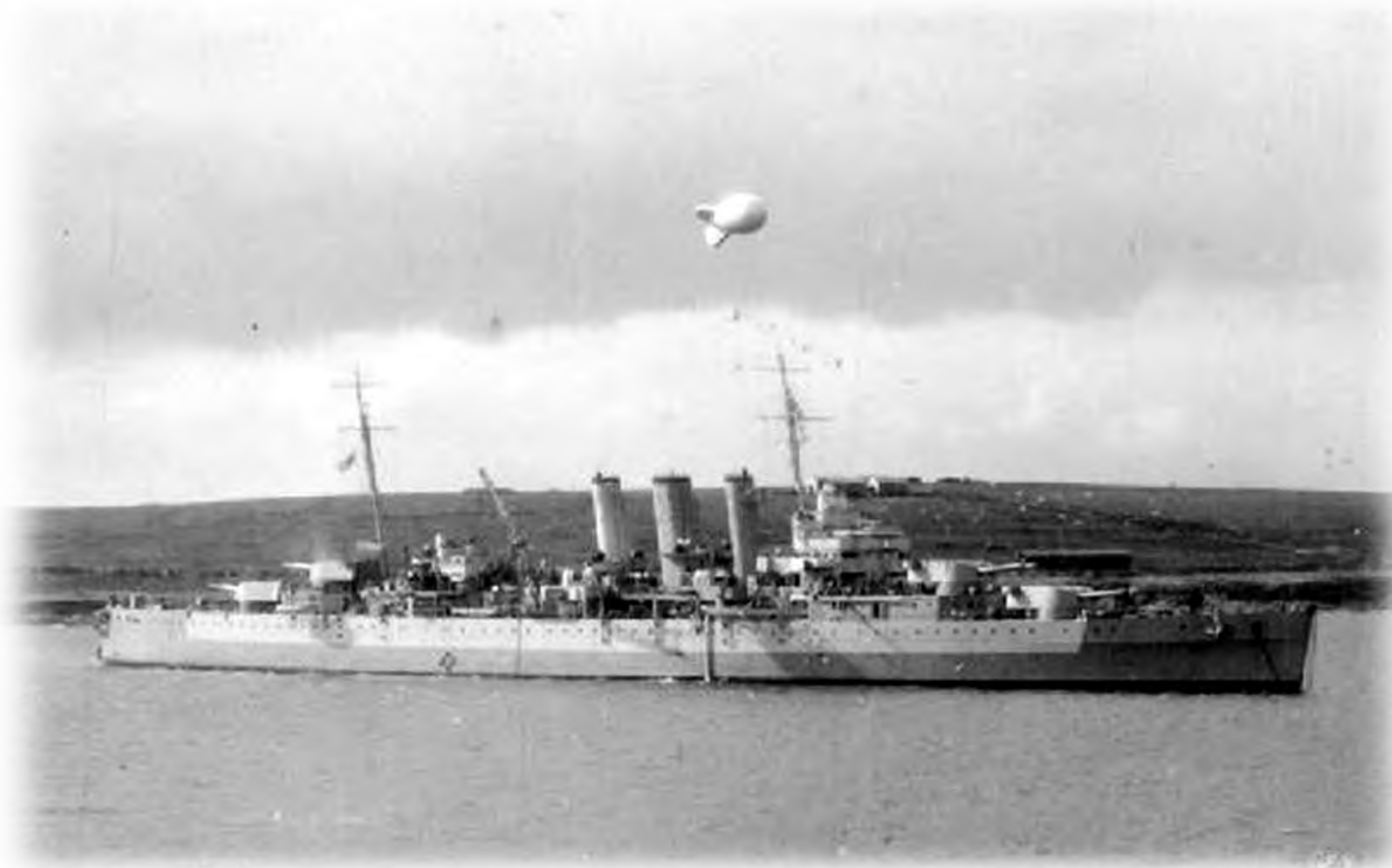
HMS Dorsetshire at anchor in Scapa Flow August 1941