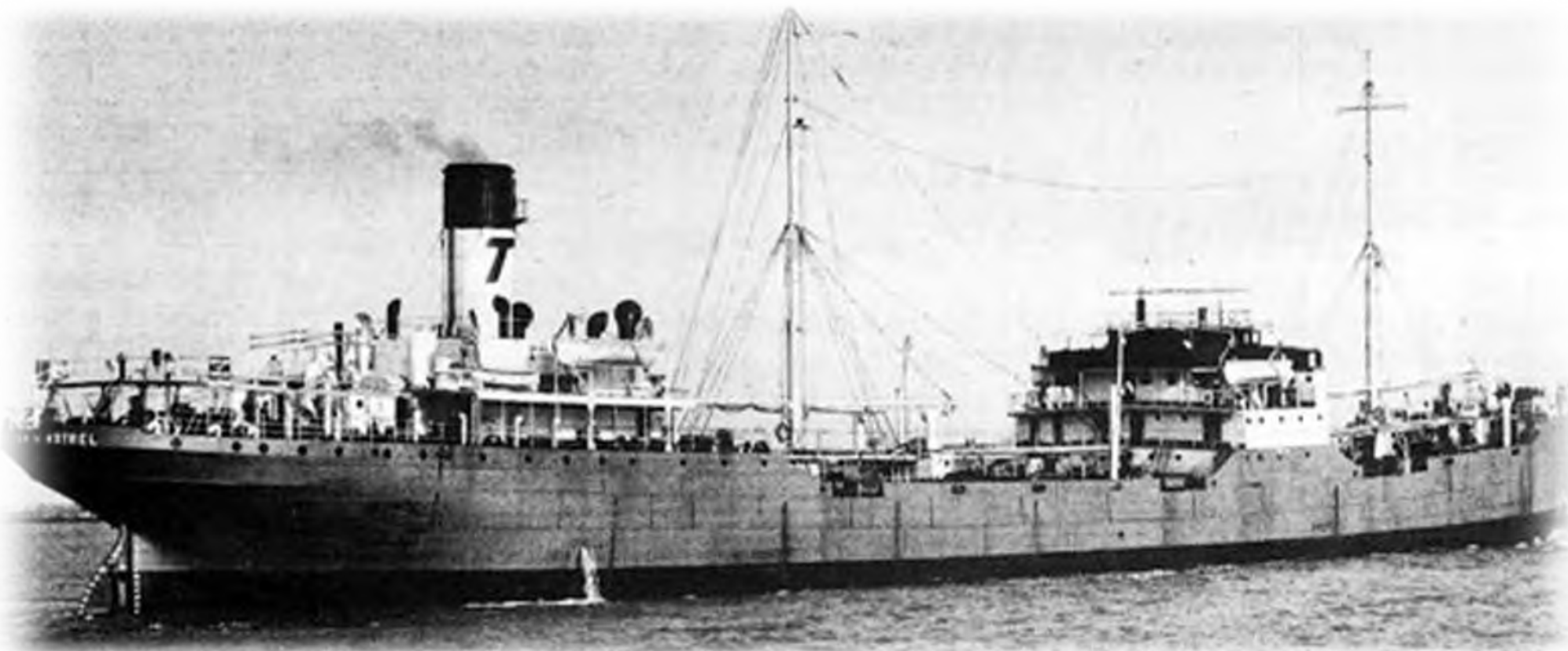
MV Scottish Minstrel: The T on the funnel is the mark of Tankers Limited, the owners