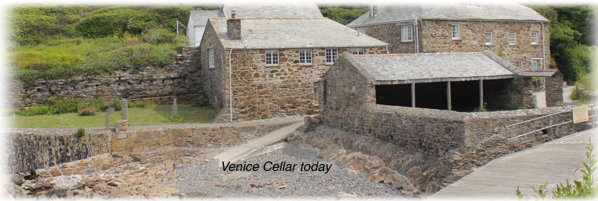
Venice Cellar today

The socket holes of the demolished half of the single arm are visible just above the grass