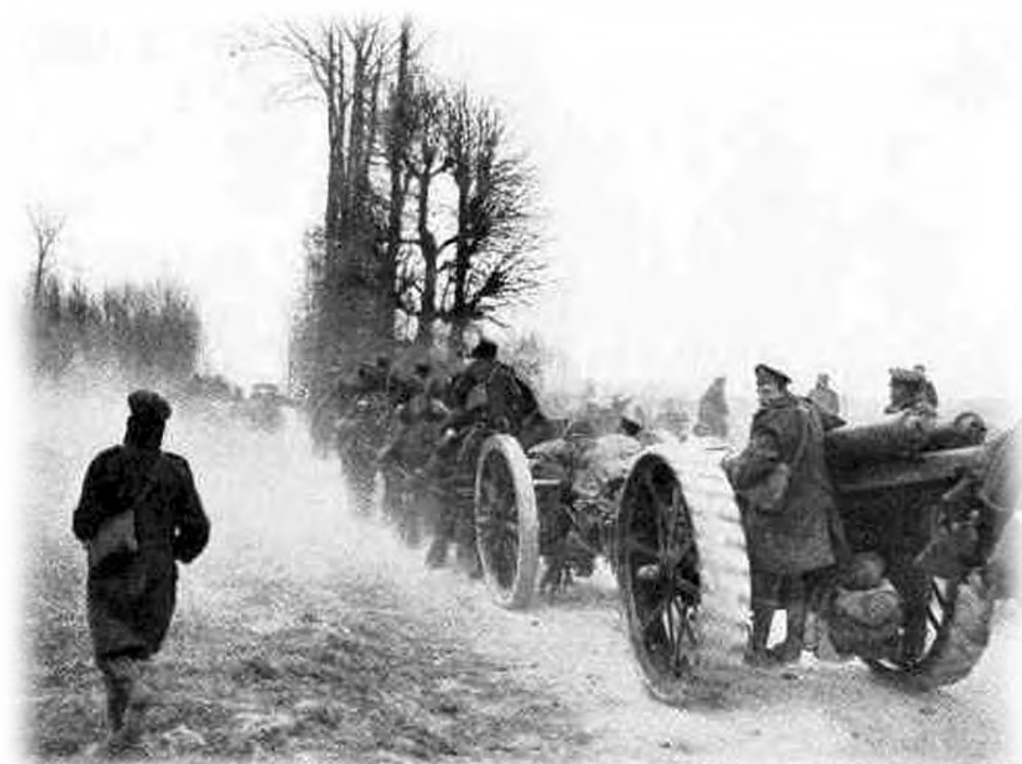
60 pounder guns of the Heavy Battery along a dusty road in Northern France

Their war diary shows the period May 21st to 24th was very quiet, although our artillery was very active each night. On May 25th 6,000 mustard gas shells fell on their section of the line between 8pm and11pm, and between 3am and 6am the following morning 9000 mustard gas shells fell. Casualties from the gas continued up to May 27th, totalling four officers and 200 other ranks.