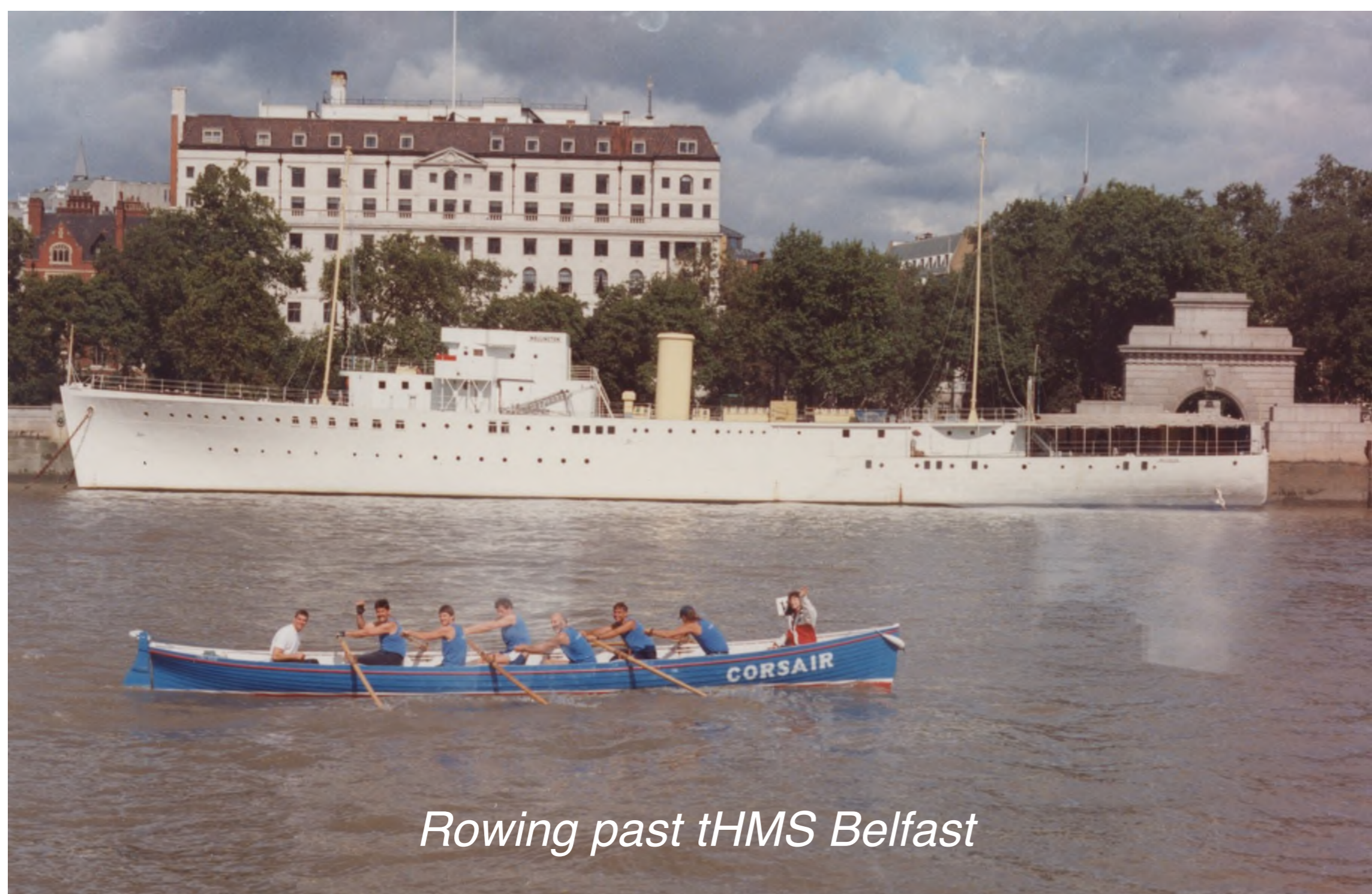
Rowing past tHMS Belfast