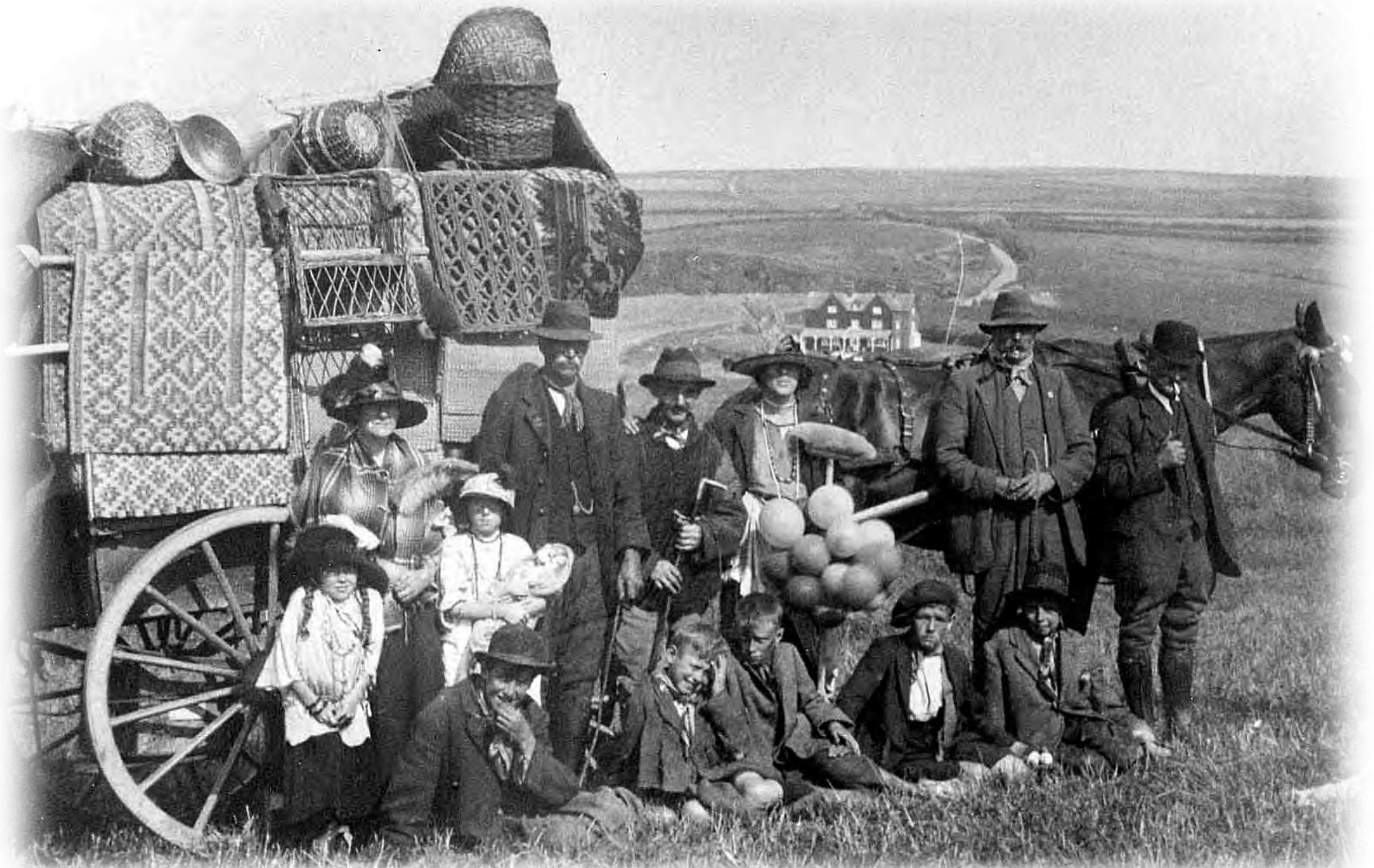
The travelling tinkers in what was the Council Car Park, evidenced by the old Headlands Hotel at Port Gaverne in the background