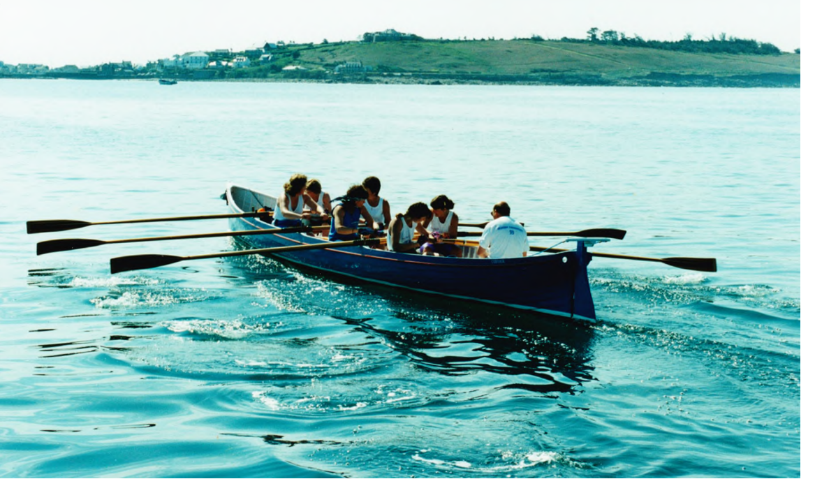
Port Isaac Rowing Club has competed in the World Championships at the Scillies every year since the event began – and even secured an overall second place in 1995