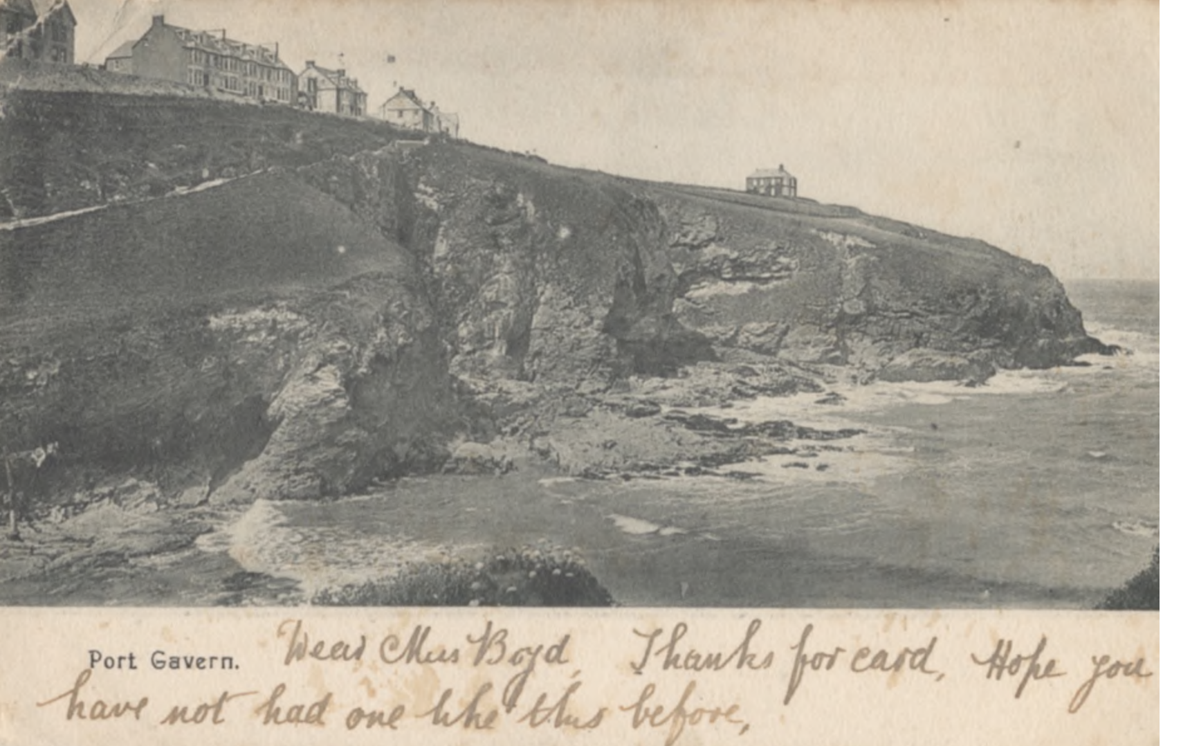
"a lovely bathing beach"