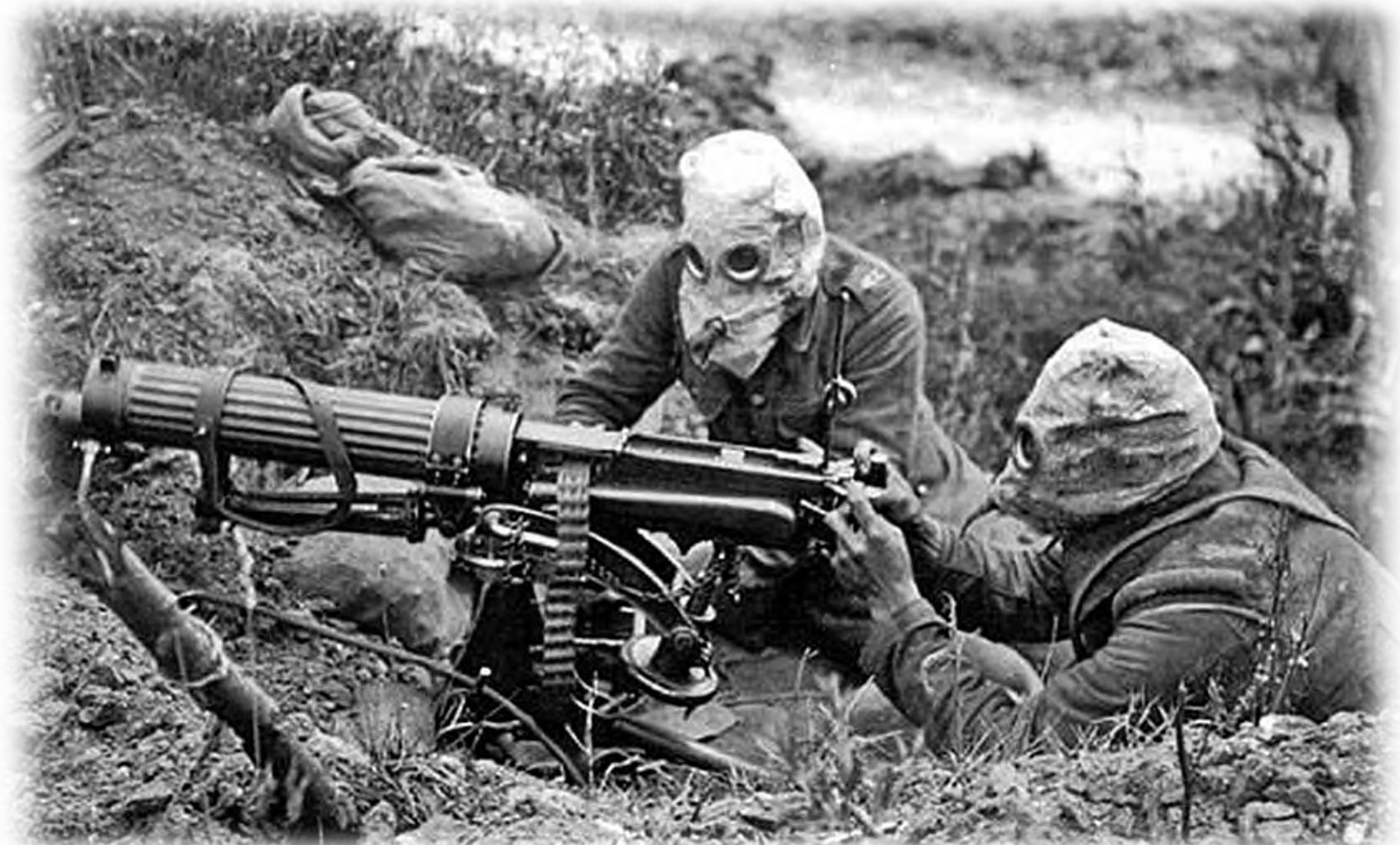
British Vickers machine gun crew wearing PH-type anti-gas helmets on the Somme in 1916