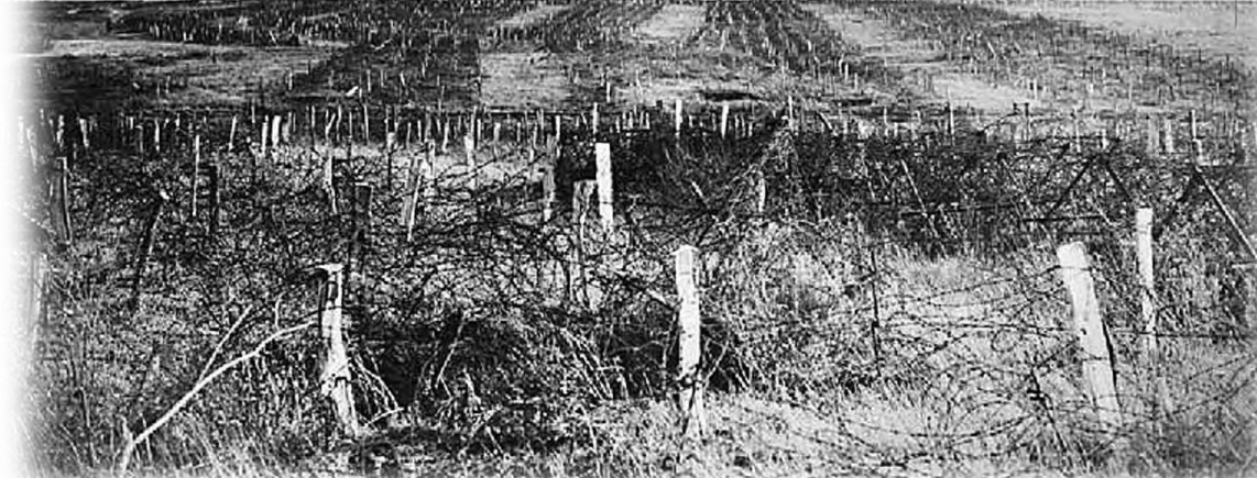
The massive extent of German barbed wire defences at Queant