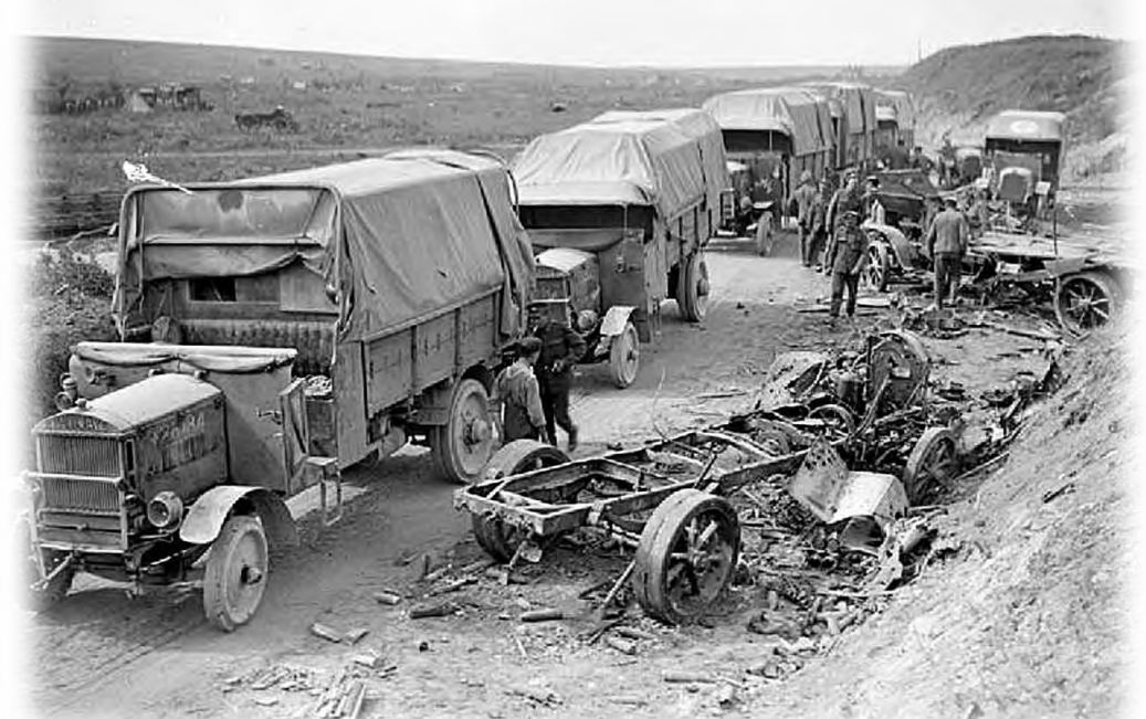
British troops stop to inspect wrecked German vehicles at Drocourt-Queant