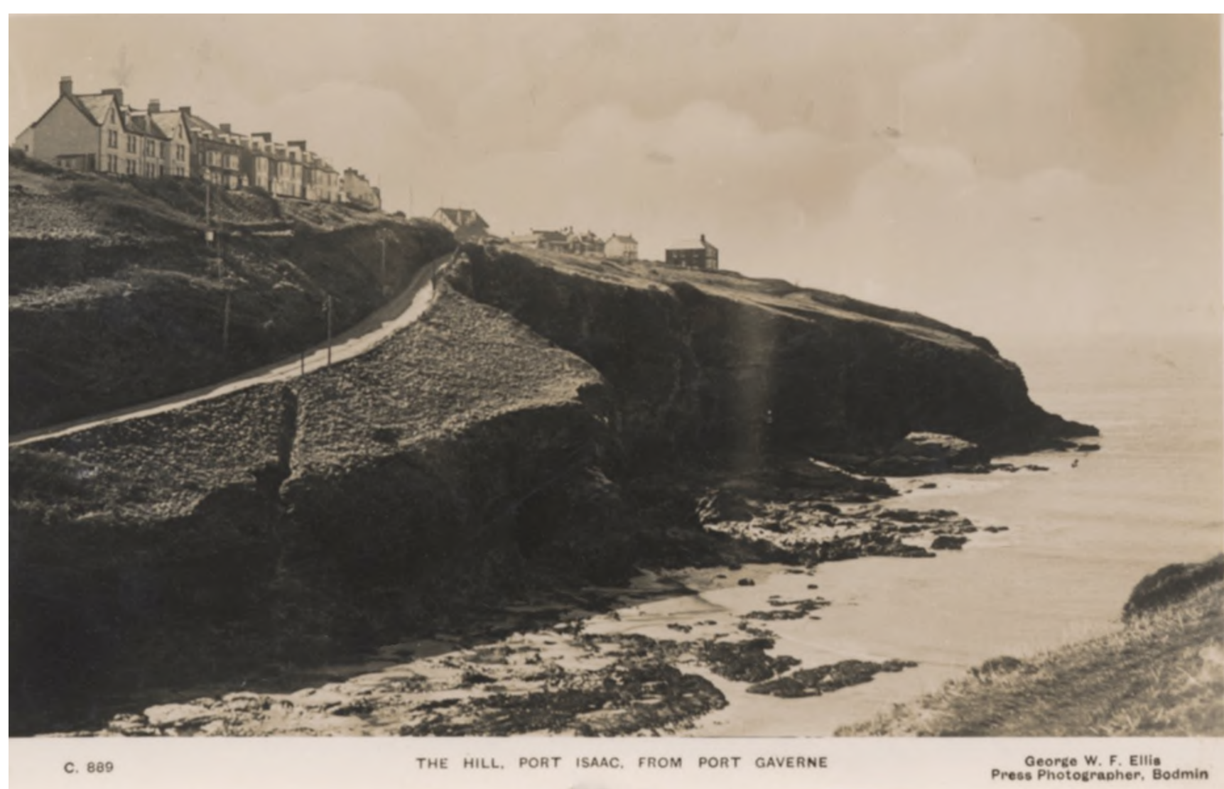
C. 889 THE HILL, PORT ISAAC, FROM PORT GAVERNE

“I remember in the 1920s it was a 12-hour journey to Port Gaverne; the car had to climb one big hill in reverse!”