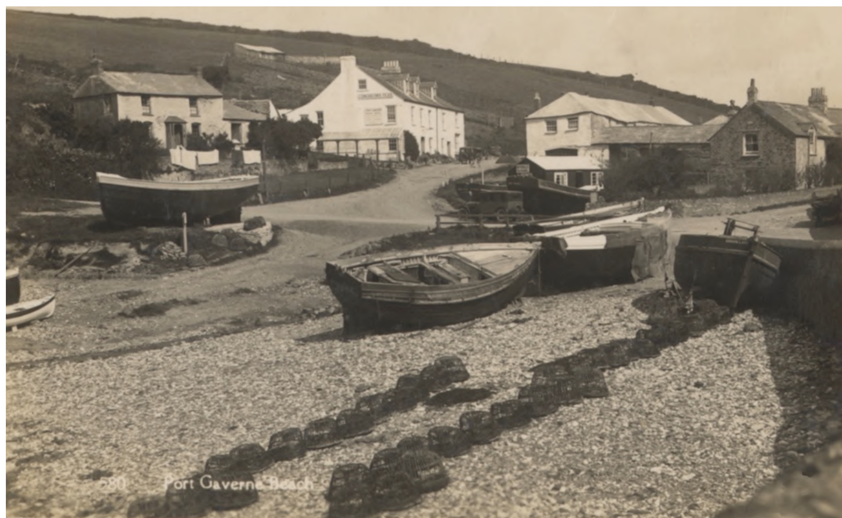
Port Gaverne Beach