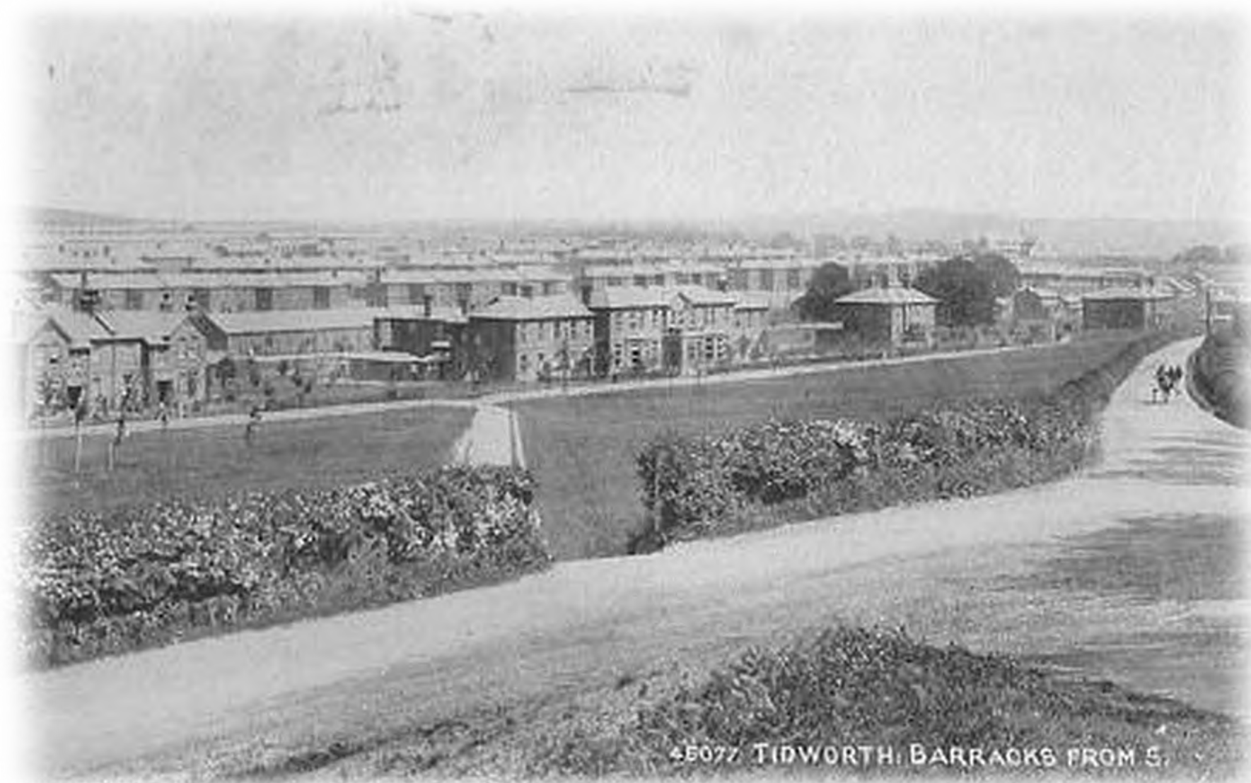
Tidworth Barracks during the First World War