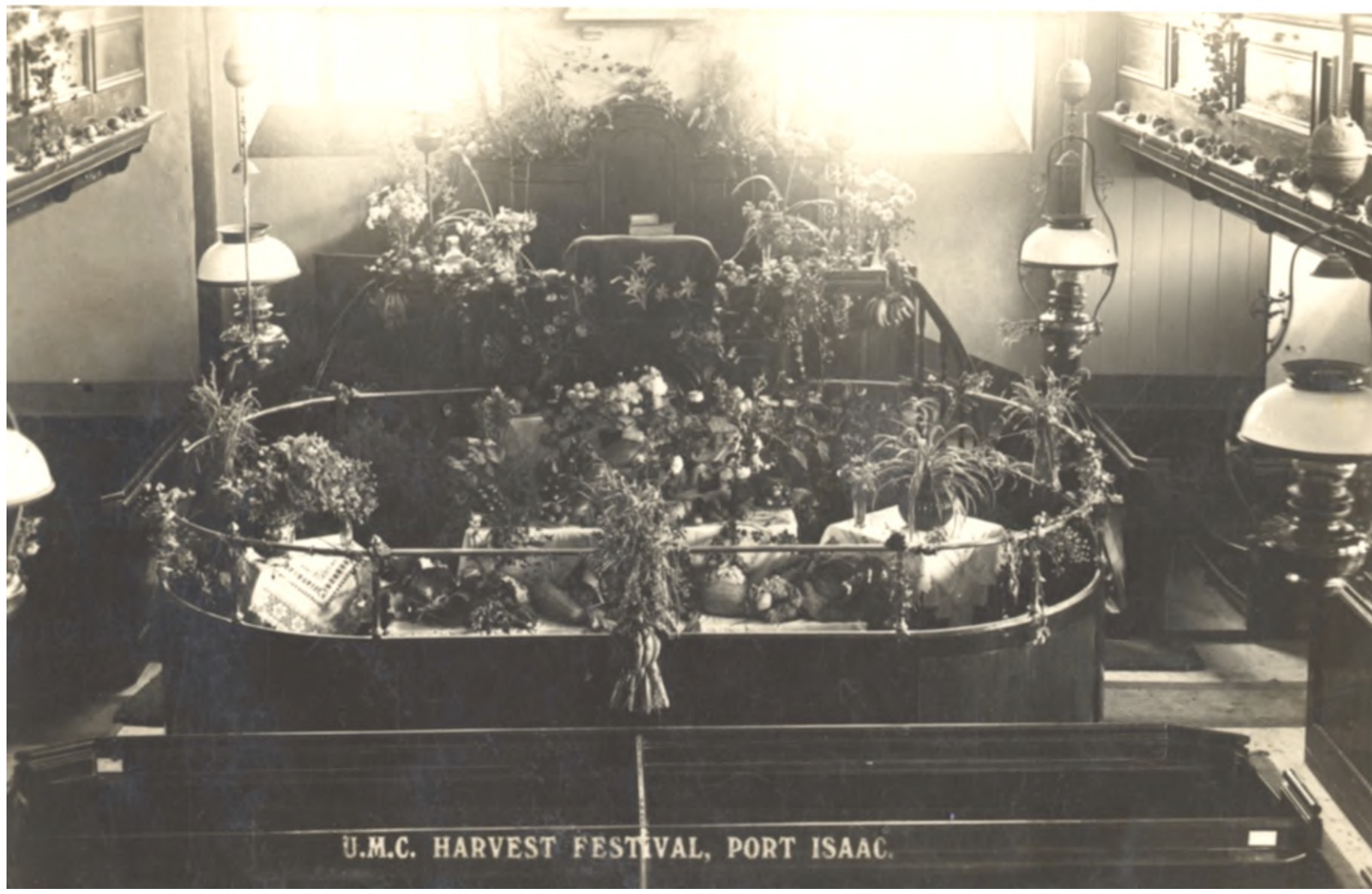
U.M.C. HARVEST FESTIVAL, PORT ISAAC.