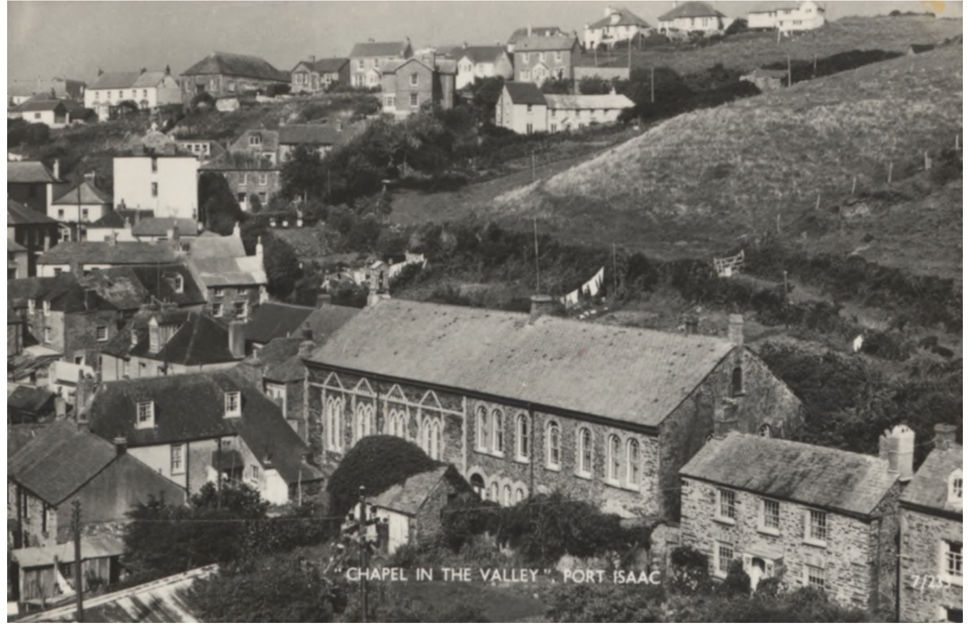
"CHAPEL IN THE VALLEY" PORT ISAAC

“Two chapels built for half a hundred souls”