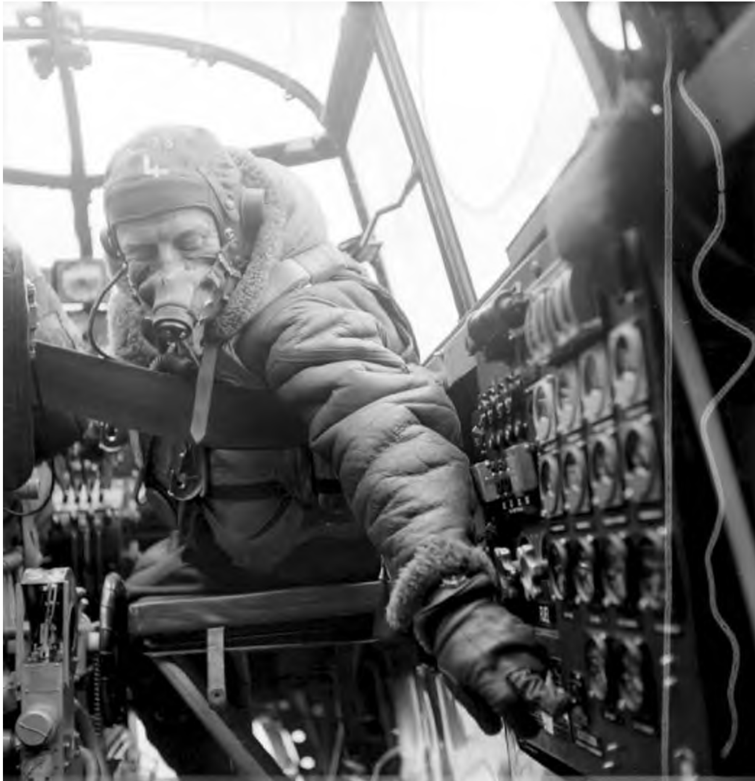
Flight engineer in a Lancaster bomber