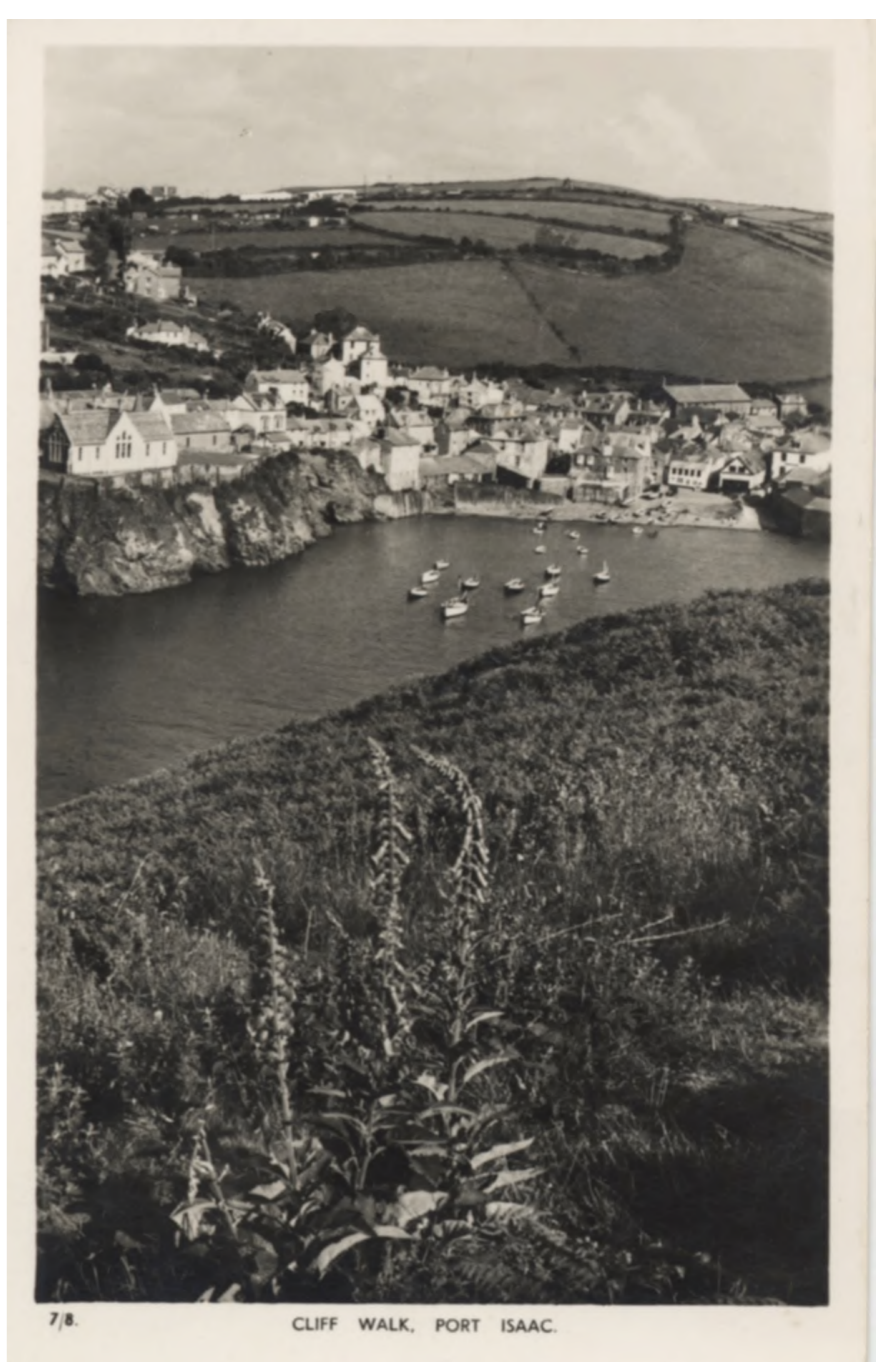
1955 - "This is a really glorious spot"

"We drove through the dawn on small winding roads until we reached the then narrow A30 - I knew then that there was time for a bit more sleep but that we were nearly there."