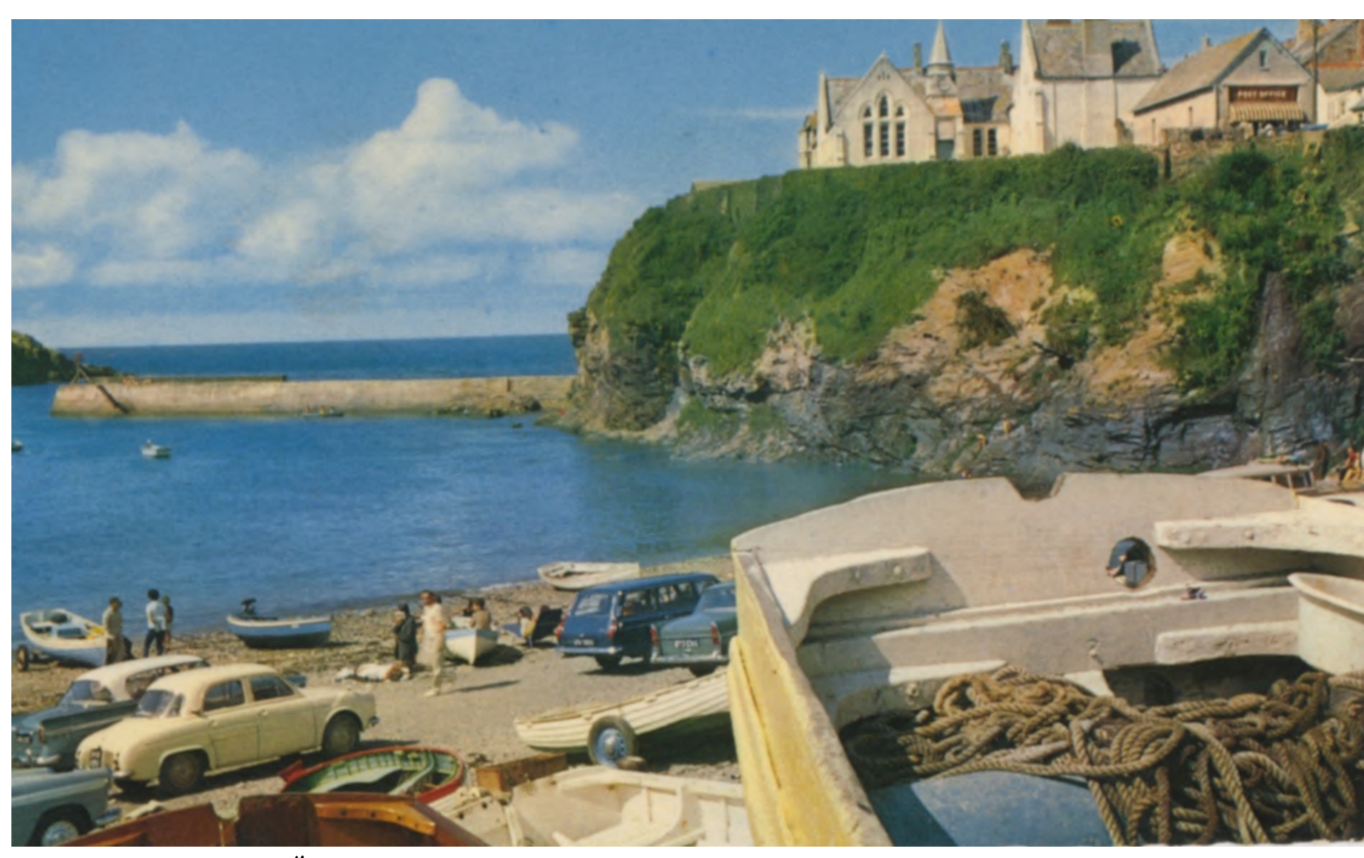
1957 - "Rose and Iris have gone to visit a castle on top of a cliff but it looked too dangerous for me"