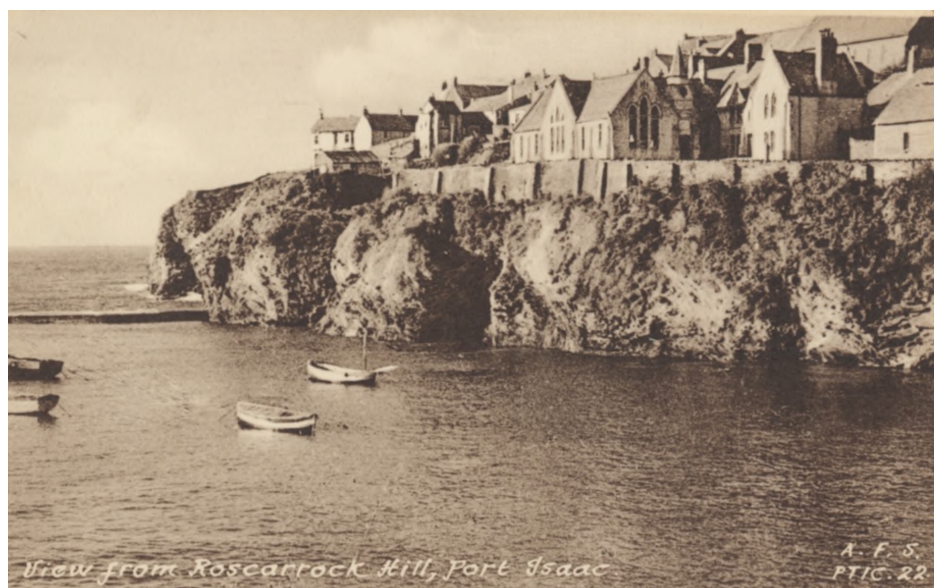
1956 - "we are finding Port Isaac even more lovelier than we had imagined"