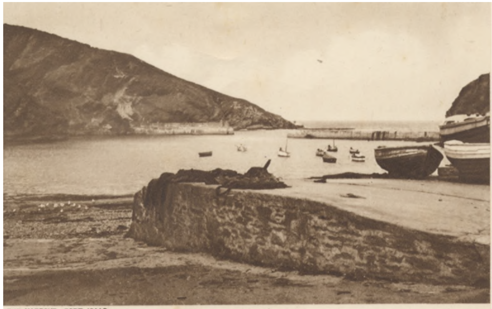
1955 - "The countryside around us is beautiful"