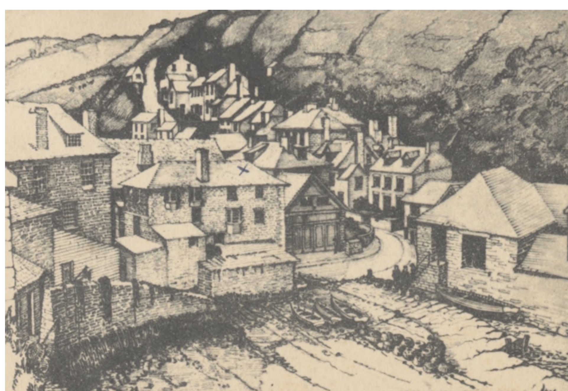
1950 - "our cottage is on this card!"