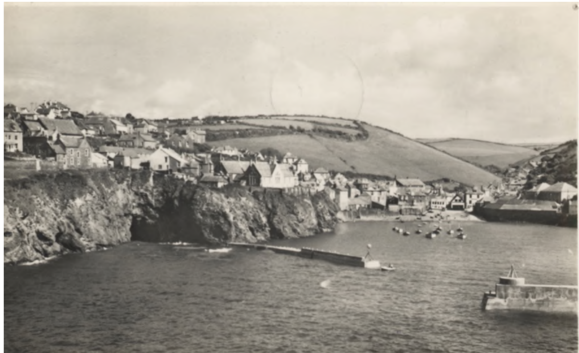
1955 - "The cottage is quite nice but oh, the hills, they are so steep ..."