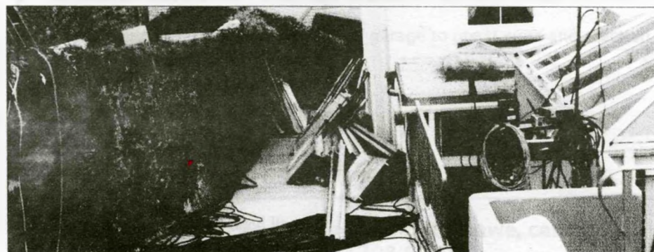
Taking over next door!

'... may the village prosper on the strength of its efforts'