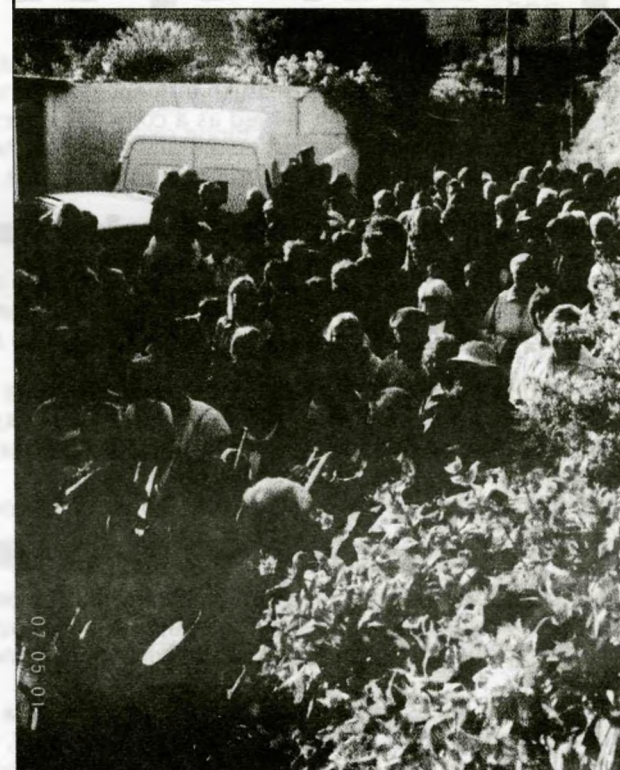
Following the St Minver Band to the 'Reveal'