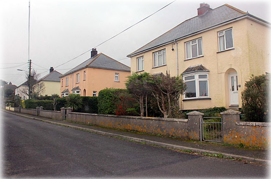
Numbers 4-9 Hartland Road