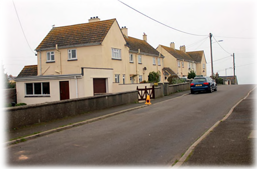
Numbers 27 & 23 Hartland Road