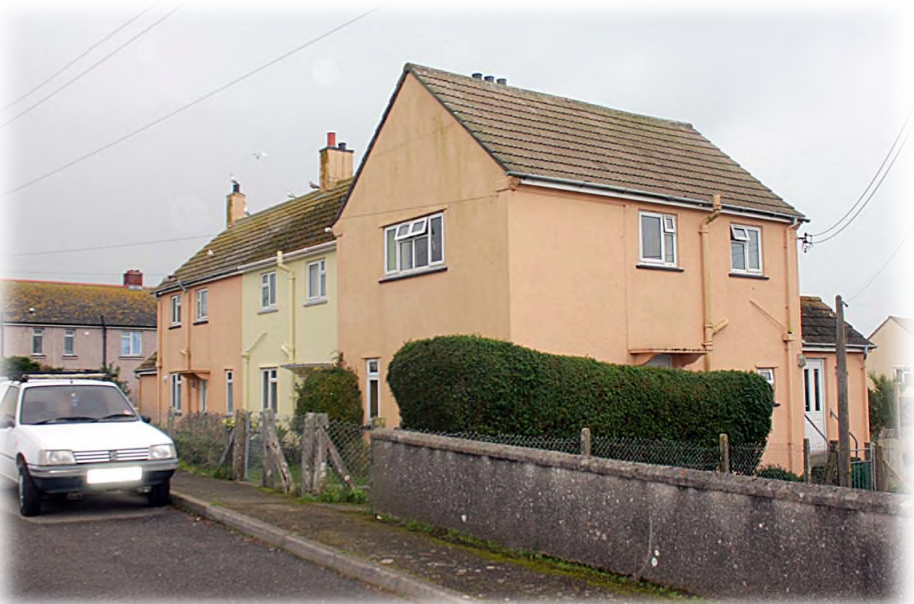
Numbers 10-12 Hartland Road