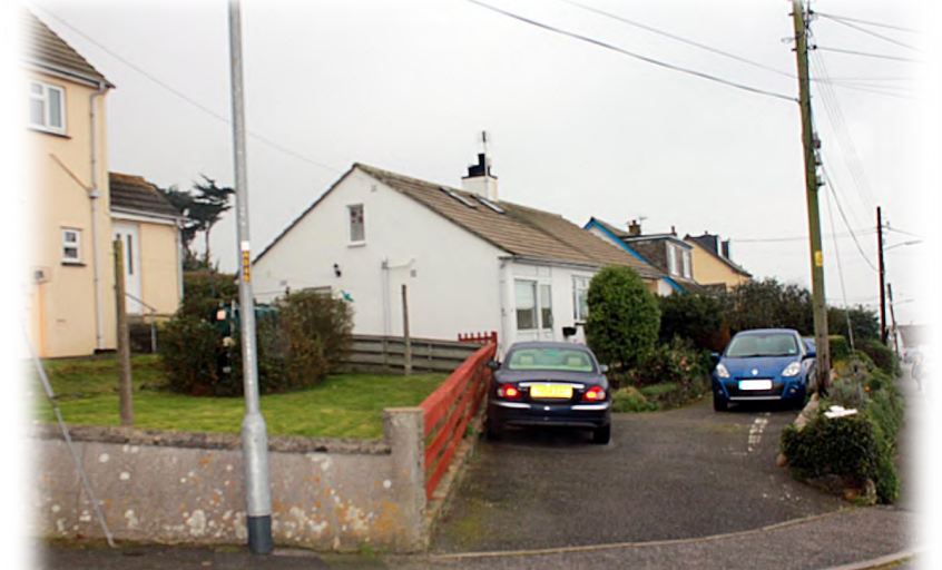
Numbers 21 & 22 Hartland Road