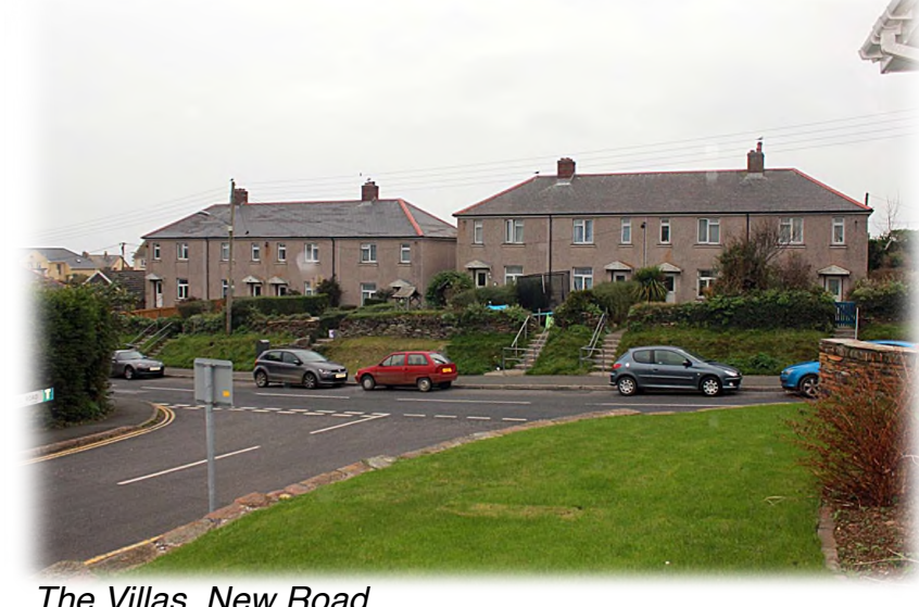
The Villas, New Road