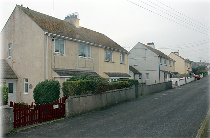
Numbers 20-15 Hartland Road