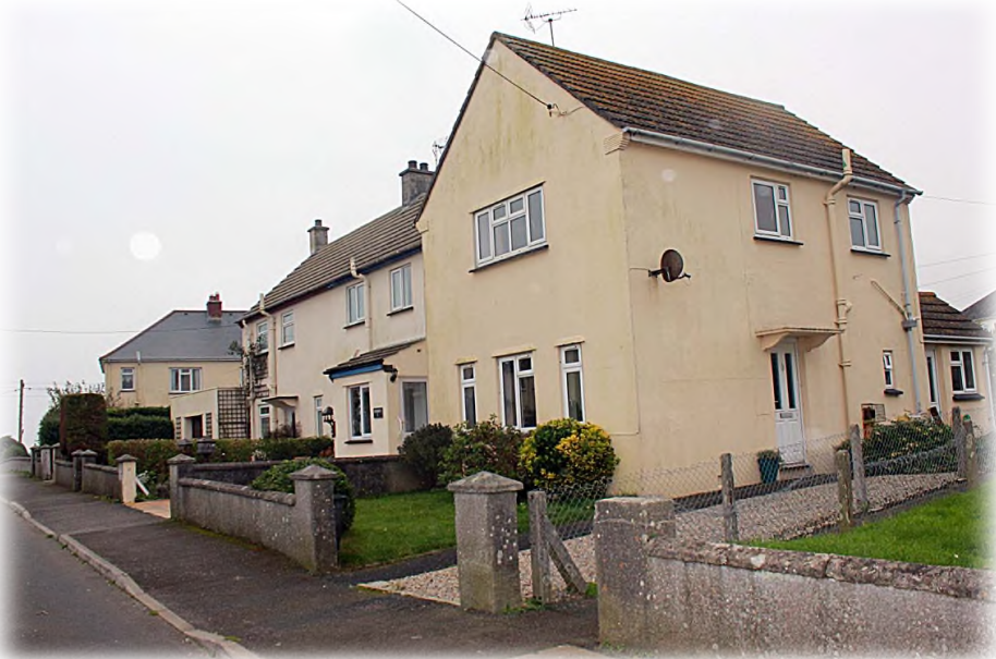
Numbers 1-3 Hartland Road