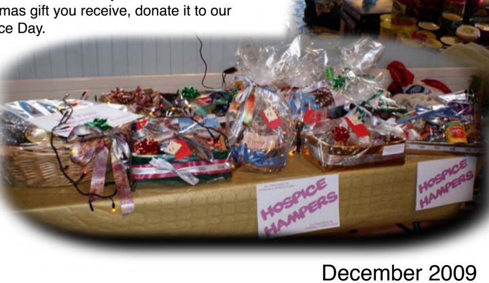
Come to our fundraising Village Christmas Lunch raising money for Cornwall Hospice Care

The date of Saturday March 13th is set for next year's Hospice Day. Remember it is in a new format - lunch, raffles, cakes, new table. So remember, if you don't like that Christmas gift you receive, donate it to our