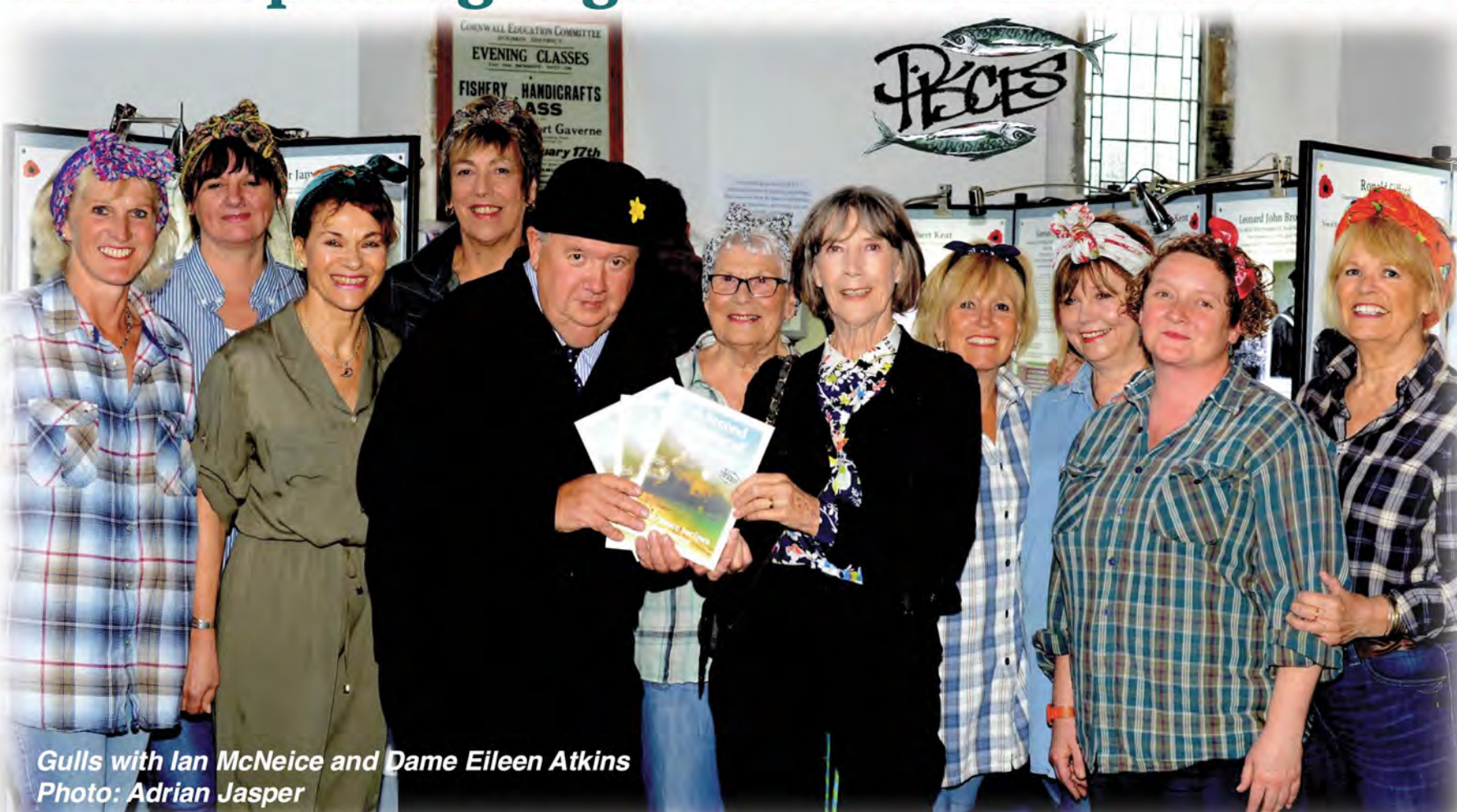
Gulls with Ian McNeice and Dame Eileen Atkins