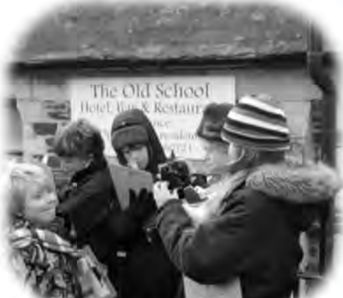
Port Isaac school children at the ready