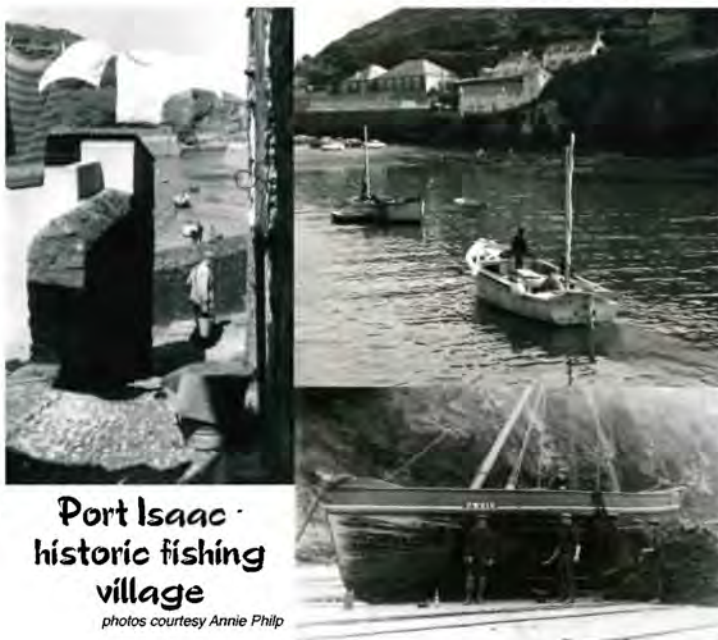
Port Isaac historic fishing village