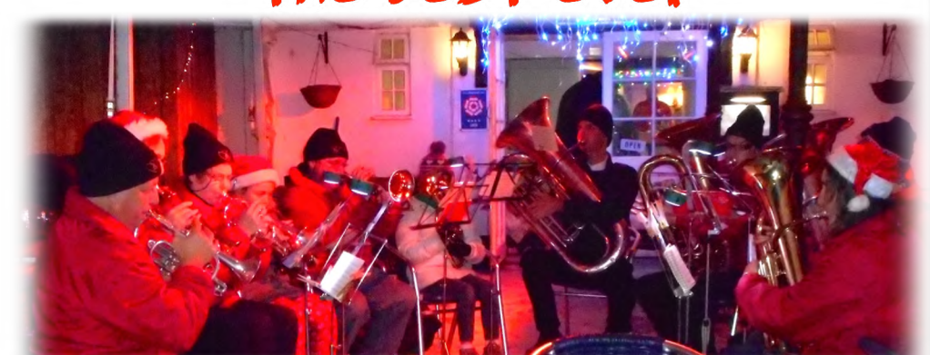
"we are now officially a village of angels!"