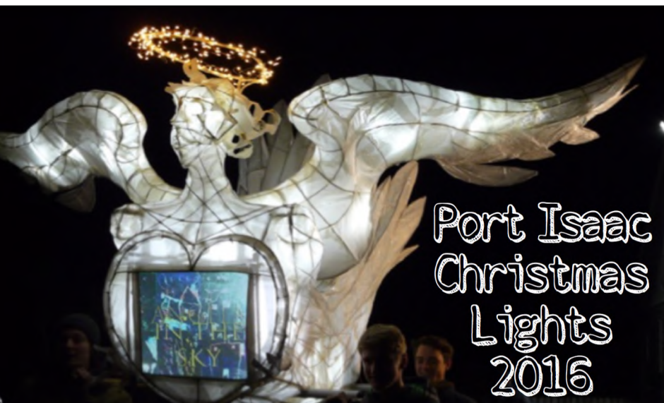
December 2nd 2016 was Port Isaac's Big Switch-on with a lantern procession through our beautiful village. Well, we promoted it as a procession but it turned out to be a wave of homemade lanterns carried by local children and very proud parents, and topped off with the majestic and graceful 'EI', Port Isaac's very own Angel of the North (Coast)!

Good news! We are a newly formed group with the sole mission of re-instating all the Port Isaac Christmas lights together with all the 'Switching on Evening' entails; singing Christmas carols on the Platt, drinking mulled wine and eating mince pies with the RNLI in the Lifeboat house and generally seeing in the festive season together. Just like the old days! Our aim is to raise money throughout the year to pay a local electrician to supply and put up Christmas lights next December. If you would like to help with fundraising ideas or anything else please come along and join us for a drink in The Edge on Thursday February 21st at 7.30pm. We already have pledges of £200 to get the ball rolling. With a whole year ahead of us it shouldn't be too difficult. February 2013