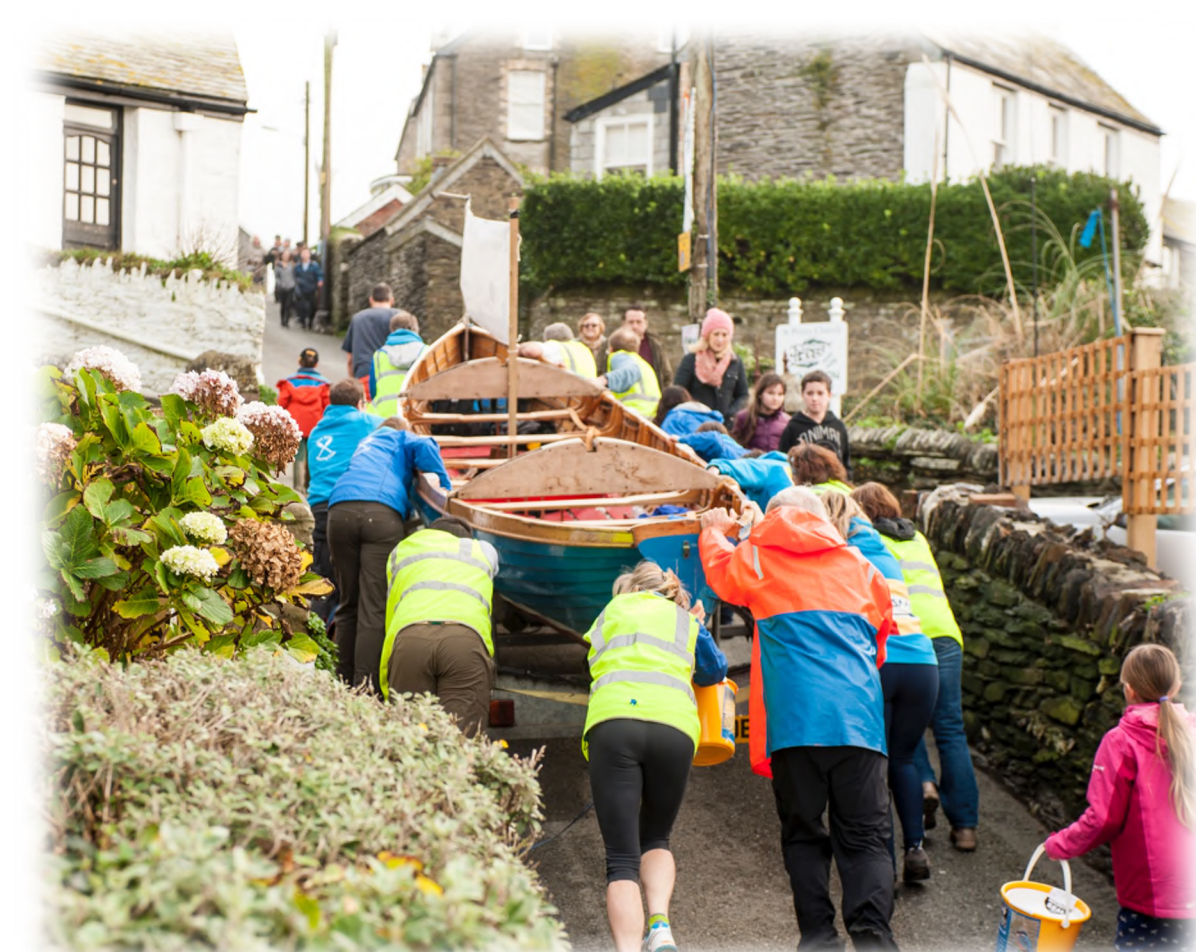
and it certainly was a PUSH!