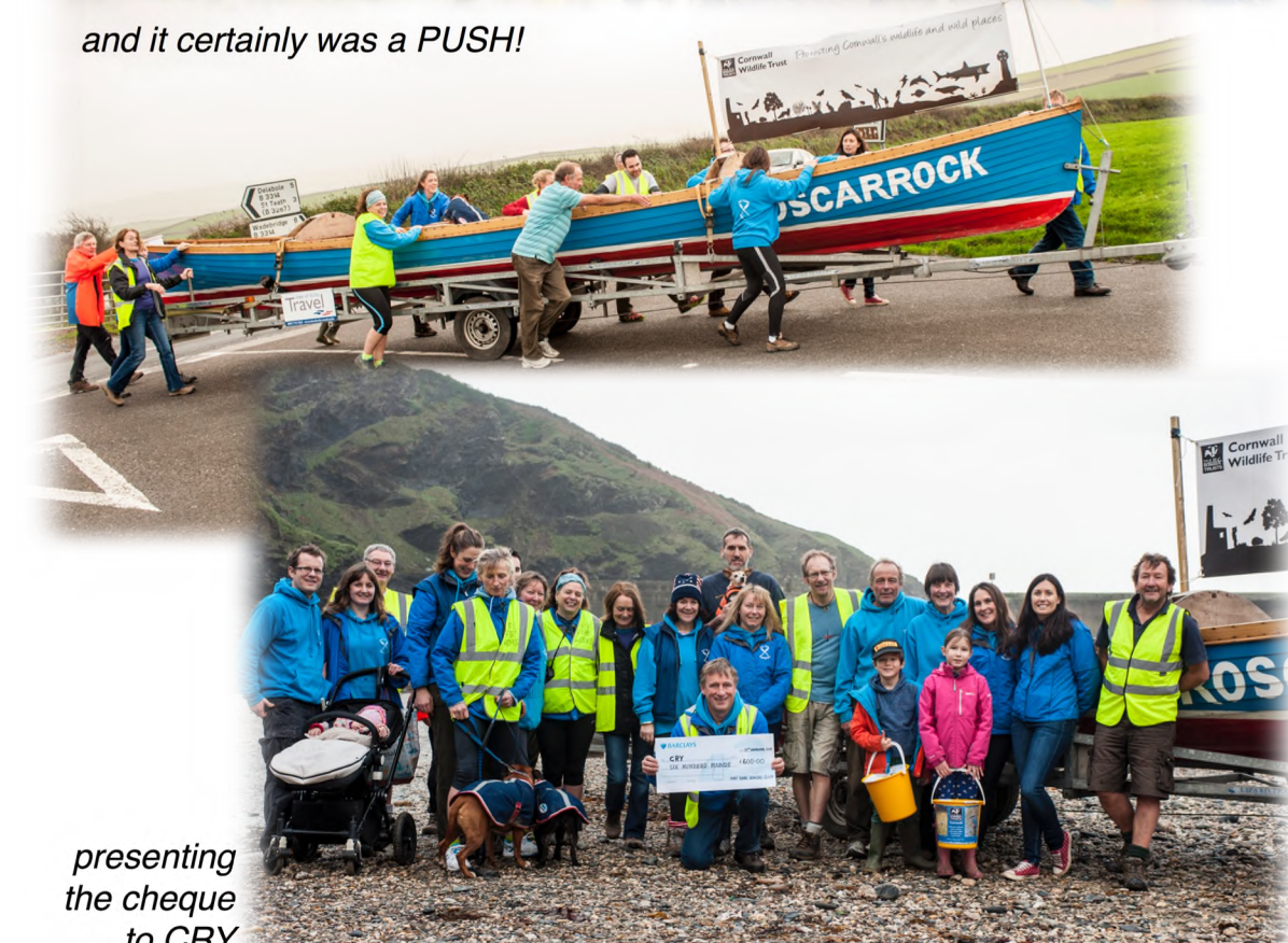
presenting the cheque to CRY