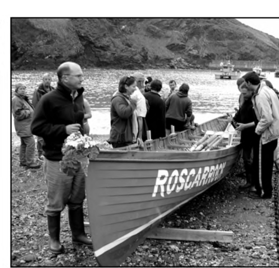
Roscarrock - ready for launching