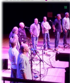
The sound check at Birmingham City Hall