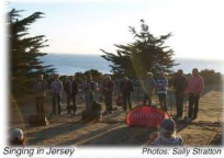
Singing in Jersey