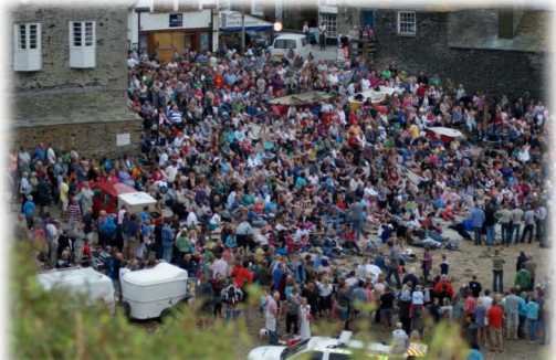
Record breaking crowds on the Platt - Summer 2011