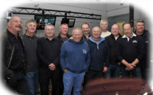
Stopping off on the way to York: In the studio with Mark Radcliffe after singing live on the BBC's Radio 2's Lifeboat & Maccos Show