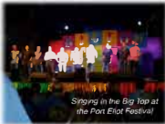
Singing in the Big Top at the Port Eliot Festival

STOP PRESS JULY 29th collection tops £2000!