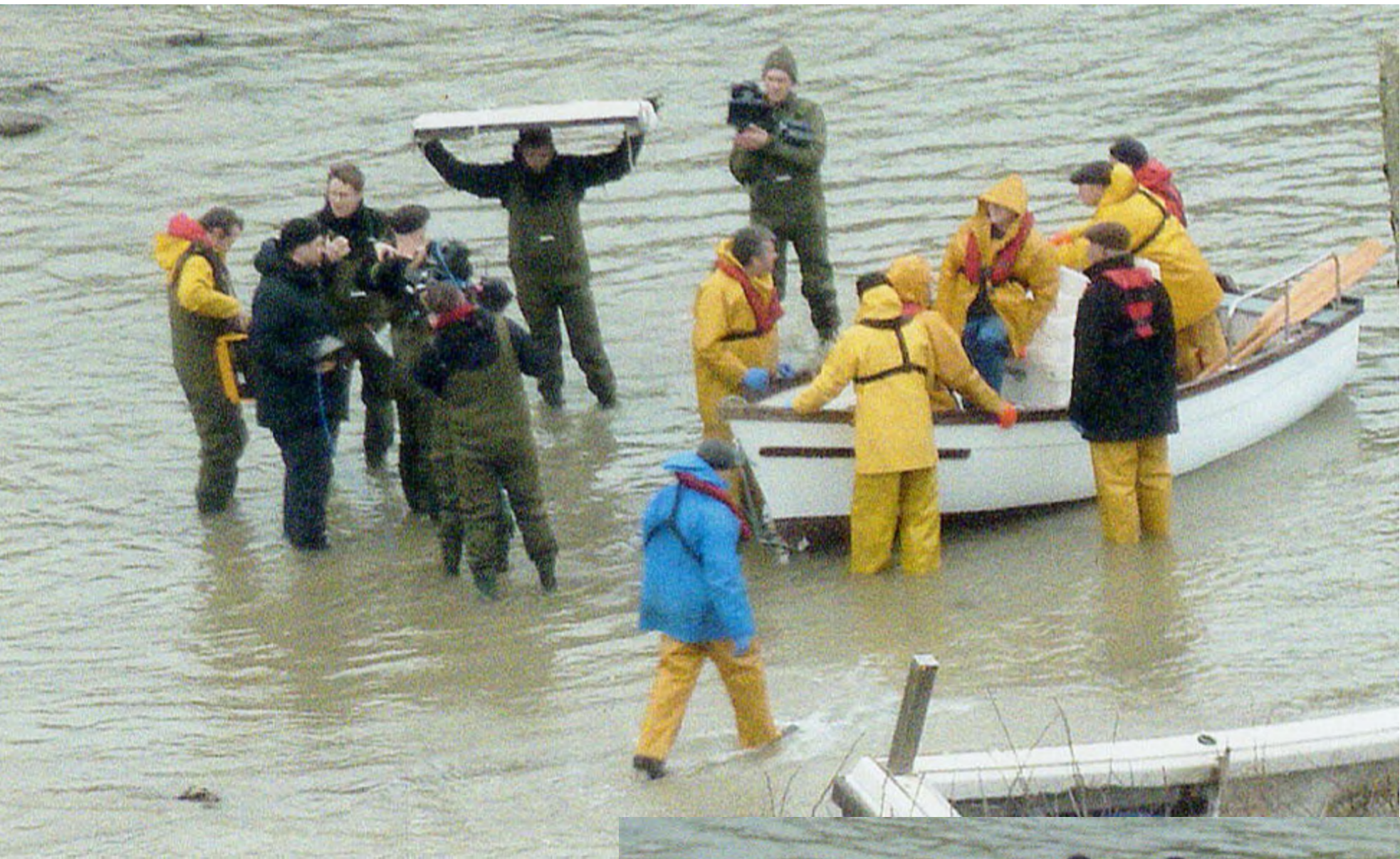
March 2011 - being filmed for their first Young's Seafood ad