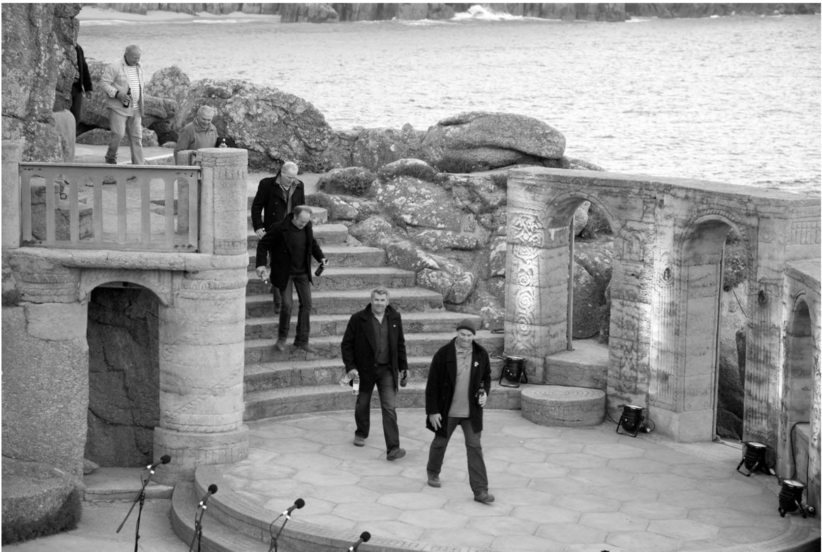
The boys arrive on stage to deafening cheers and rapturous applause that continued all night The Minack, May 2011

2011 "... it won't be long before they start their summer sessions on the Platt. The first night is Friday May 27 th when they officially open the Port Isaac Music Festival. Before that they will be at the Bristol Folk Festival on April 30 th , the Du Maurier Festival in Fowey on May 12 th and two nights at the Minack, May 19 th and 20 th . The Falmouth International Sea Shanty Festival is on June 18 th and more dates will be published next month ..."