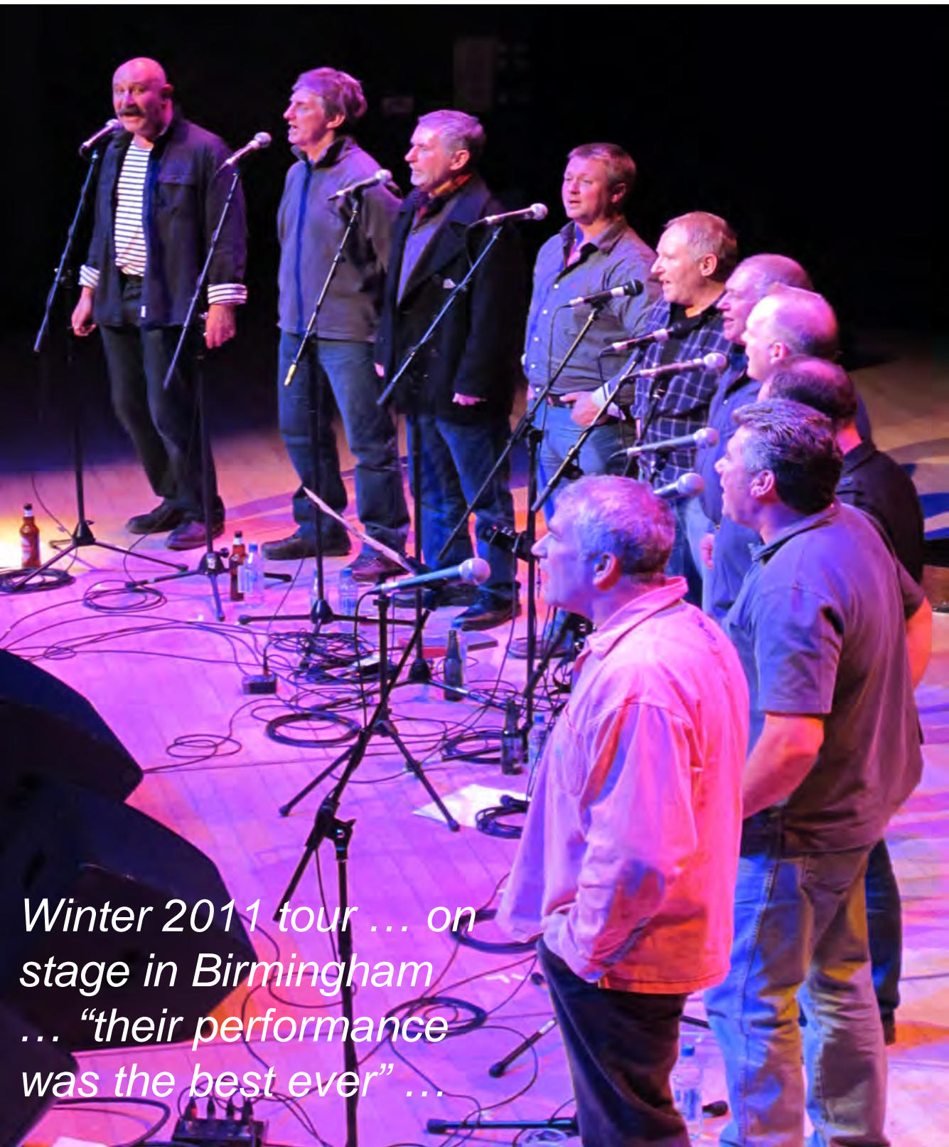
Winter 2011 tour ... on stage in Birmingham ... "their performance was the best ever" ...