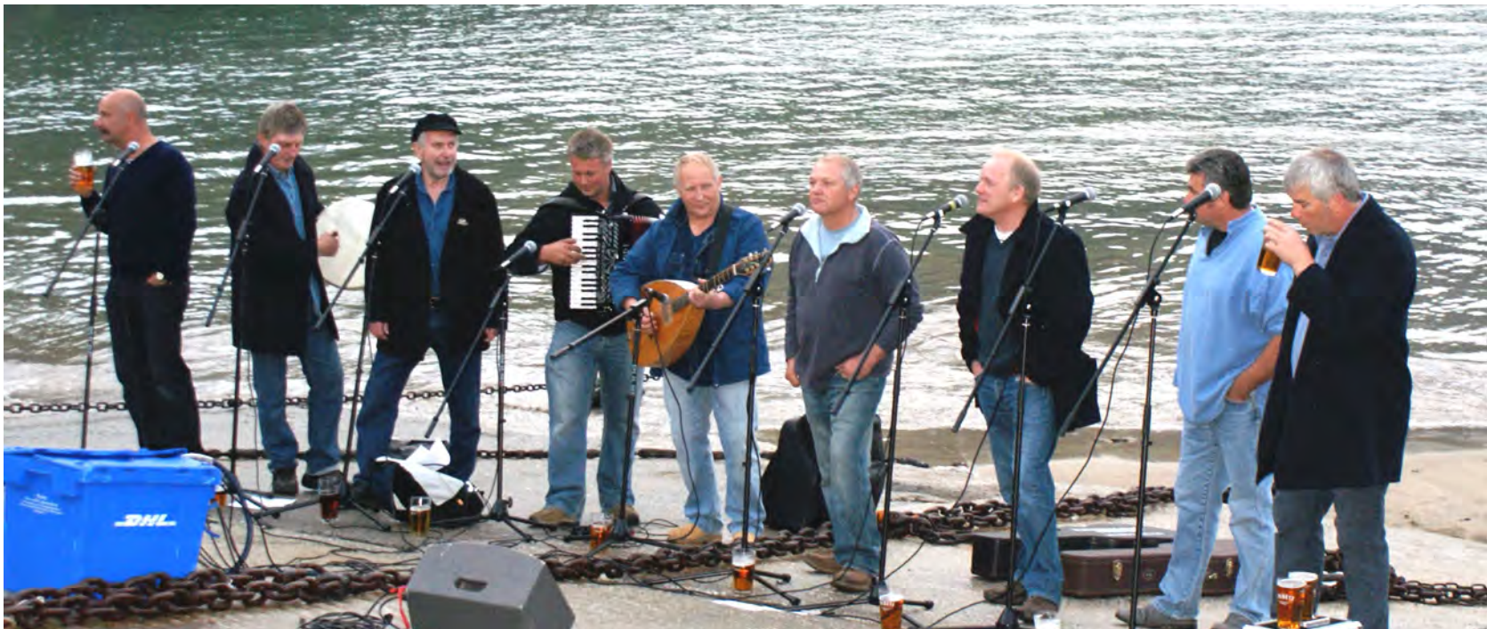
The Fisherman's Friends make an impromptu first night on the Platt on Good Friday 2011 - and a first - a member of the audience was given the mike and he got down on bended knee and proposed to his girlfriend - she accepted!