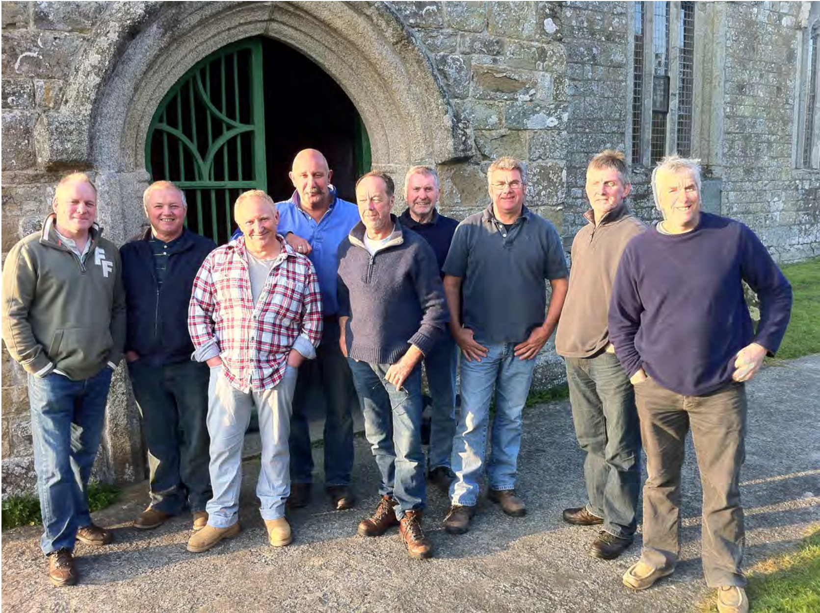
March 2011 and the boys are recording again in St Kew Church