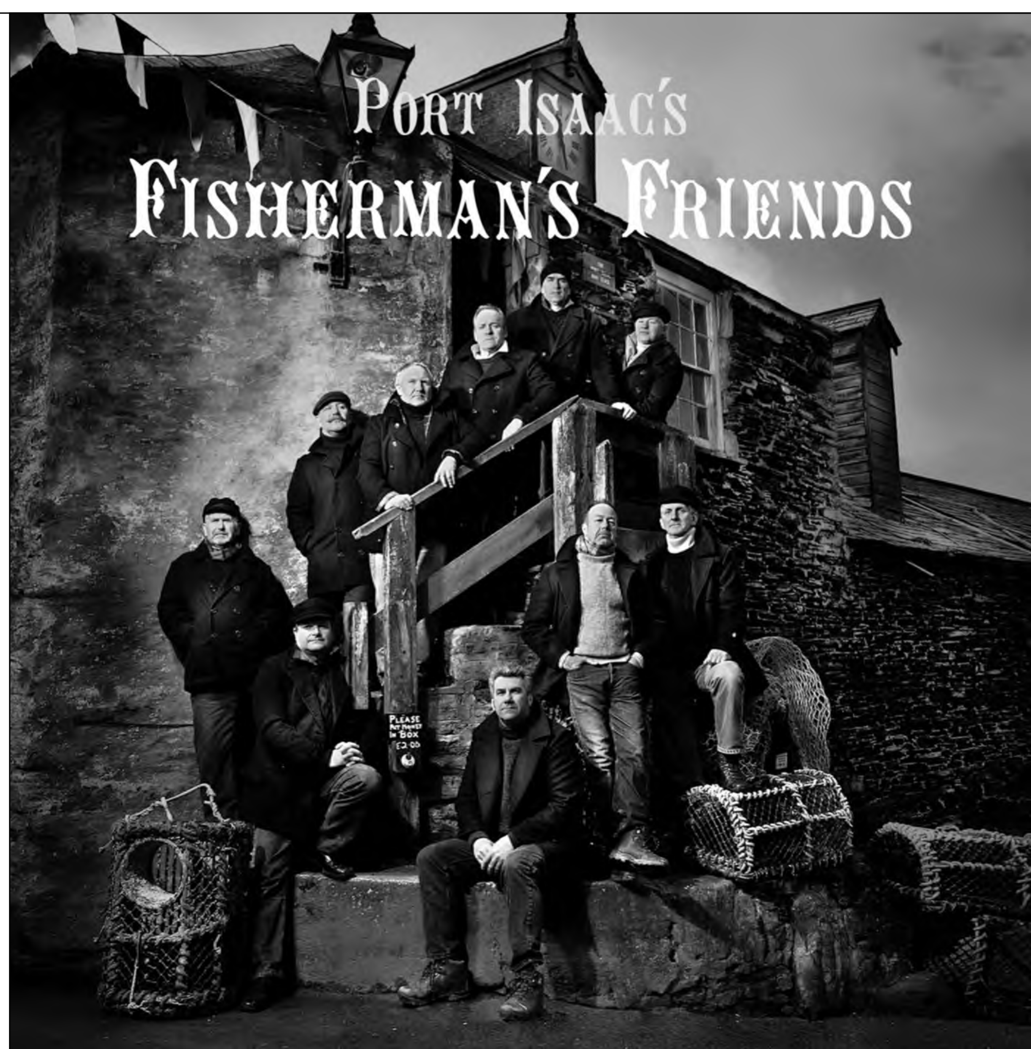
The new album, Port Isaac's Fisherman's Friends , quickly reached number one on the Amazon pre order chart ...