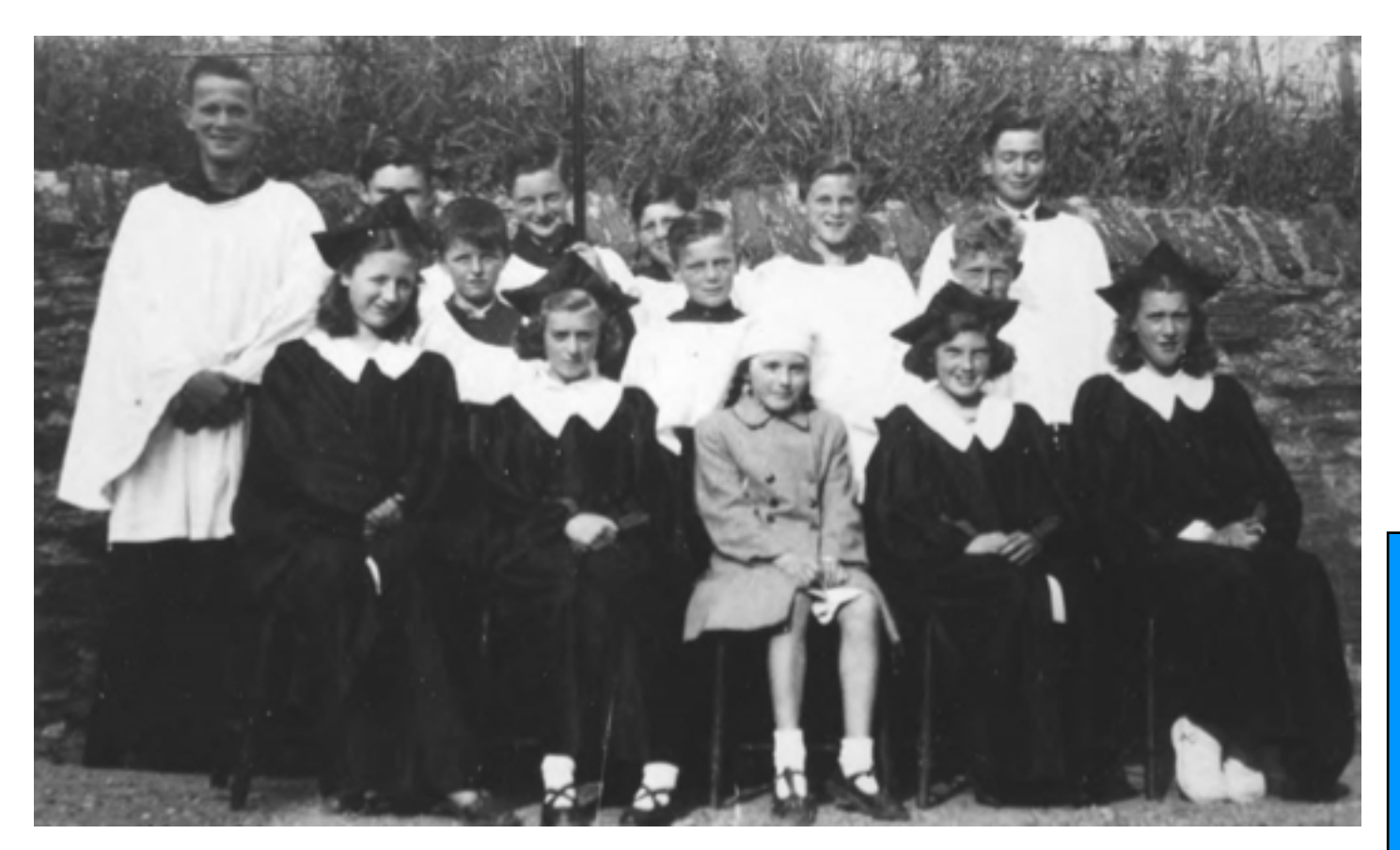
St Peter's Church Choir 1951