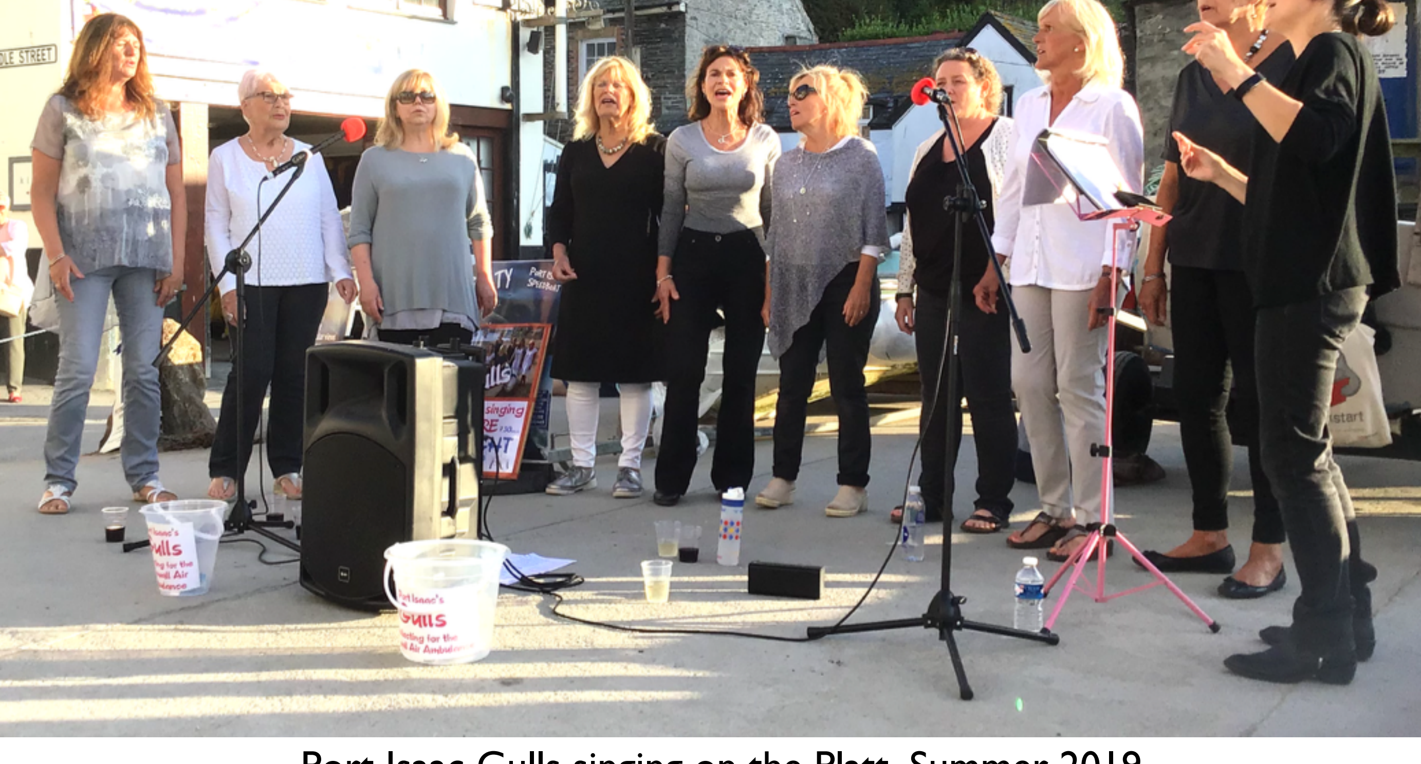
Port Isaac Gulls singing on the Platt, Summer 2019