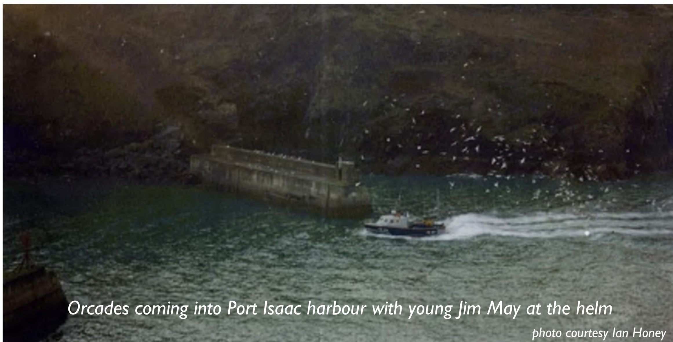
Orcades coming into Port Isaac harbour with young Jim May at the helm