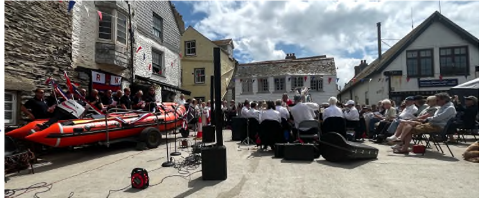
Thank you to all who came along to our Lifeboat Service on the Platt on Sunday 11th June. The sun shone and it was a lovely event. Thanks to your generosity we raised £500!

Thank you to all who responded in what has been another busy month.